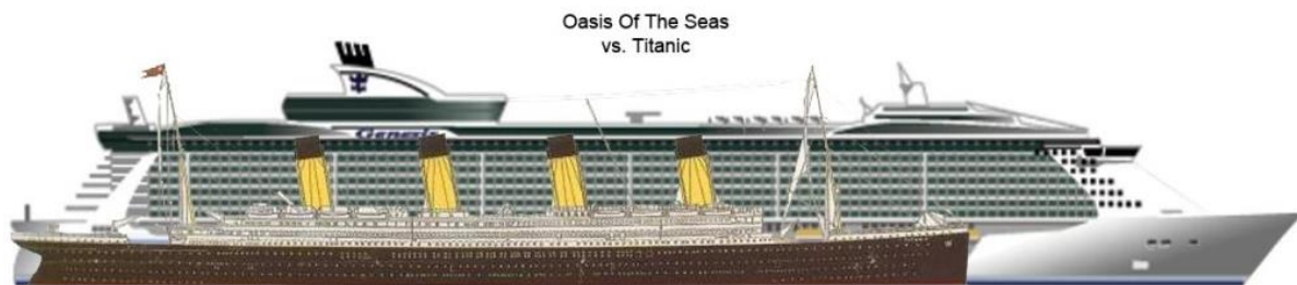
Figure 8. Comparison of Oasis Of the Seas and Titanic

The presented paper produces a few different conclusions that all provide clear explanations why the procedures of arrival and departure in an international port are necessary and what is their real purpose. In the introduction I tried to explain how much human race has grown, how our technological breakthroughs had enabled us things that were considered impossible just few years or decades ago. Little more than hundred years ago, RMS Titanic, called “The unsinkable ship” 27 was a miracle of engineering and technology. The comparison of the “Titanic” and “MS Oasis of the sea” (Cruise ship produced in 2009) sets us in the right perspective.