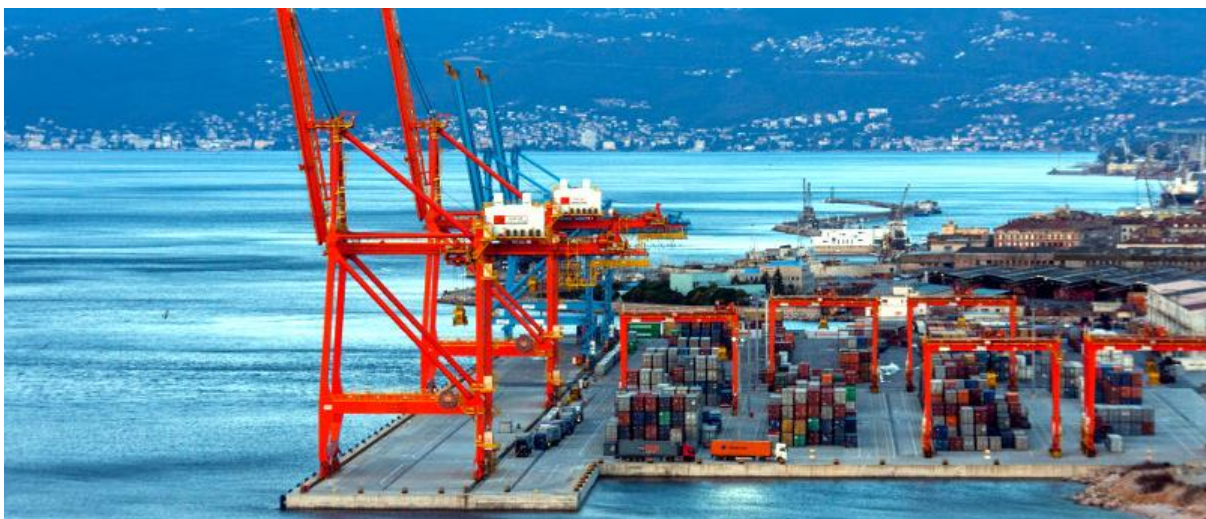
Figure 2. Port of Rijeka

Rijeka port is also a dry port because it has direct rail connection with the center for the transshipment of sea cargo. As approaching coast and port, the ship's pilot has to report her ETA arrival. Port authorities use Vessel traffic service (VTS) which operates as an air traffic control for aircrafts. In order to secure safe sea traffic, VTS is used by trained professionals who perform required tasks. One of the tasks is monitoring vessels that are approaching and telling their crew what to do in favor of faster arriving and departing from the port. Therefore, ship's pilot is communicating with local port authorities with the help of radio communication systems, while defining vessel's position and its course with the help of radar. Entire procedure is explained in the next few chapters.