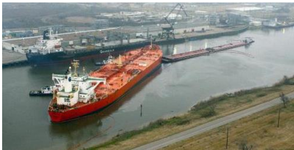
Figure 7. Collision of two ships in Texas port

Figure 7. shows collision of two ships which resulted with spilling as much as 450,000 gallons of crude oil in June 2010. 25