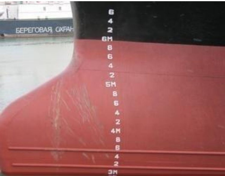
Figure 3. Hull of boat marked with draught depth

A buoy is something like a floating station that has many different purposes. It can be used as a sea mark which shows specific maritime channel and helps ships navigate safely. Also, it can be left to float by scuba divers that mark their positions. The usage of the buoy is defined by its features. For example, a red buoy that features like a floating tower is navigational buoy while the yellow one is a weather buoy. They also define port districts which enable easier navigation when arriving or departing from the port. The Figure 3. is a representation of draught and the Feature 4. is a simple navigational buoy.