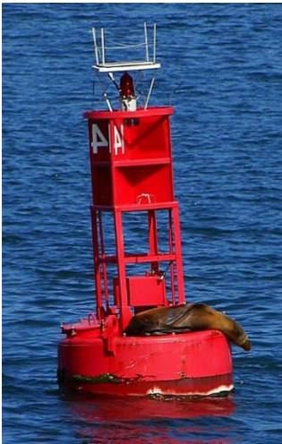
Figure 4. Navigational sea buoy in company of sea lion