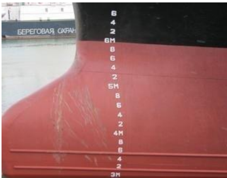
Figure 3. Hull of boat marked with draught depth

A buoy is something like a floating station that has many different purposes. It can be used as a sea mark which shows specific maritime channel and helps ships navigate safely. Also, it can be left to float by scuba divers that mark their positions. The usage of the buoy is defined by its features. For example, a red buoy that features like a floating tower is navigational buoy while the yellow one is a weather buoy. They also define port districts which enable easier navigation when arriving or departing from the port. The Figure 3. is a representation of draught and the Feature 4. is a simple navigational buoy.