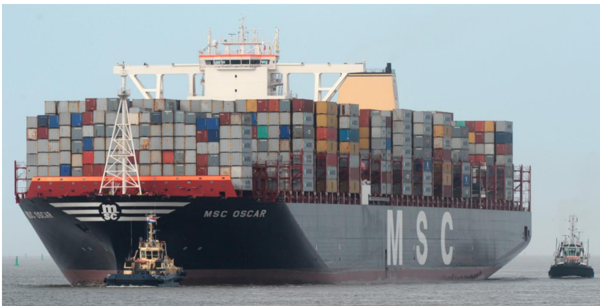
Figure 1. one of the largest container ships in the world MSC Oscar

In order to understand the whole procedure of arriving and departing from port, one must understand basic entities, business functions and terms used in such procedures. Firstly, ship is arriving in an international port. Which type of ship will arrive in which port depends on the type of port, type of ship, and the ship's route. Therefore, a ferry will not arrive in a fishing port. There are various types of ships such as: container ships, bulk carriers, tankers, ferries, cruise ships and specialized ships. The container ship is a cargo ship designed to carry containers.