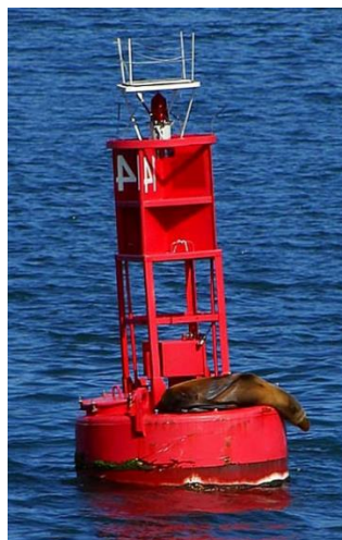
Figure 4. Navigational sea buoy in company of sea lion