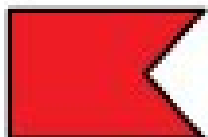
Figure 5. Red code flag that in international code means that vessel is taking in, or discharging, or carrying dangerous goods

Specified vessels in this case are ships that transport dangerous cargo. There are all sorts of dangerous cargo, but in this case port authorities of London defined them as vessels which carry explosives, flammable or toxic substances. As one can notice they must have a visible red flag during the day and an all-round 22 red light during the night. There is an obvious reason for this practice, and the reason is safety. It would be careless to leave vessels with dangerous cargo unmarked, therefore every other vessel near it could not notice potential danger and act accordingly.