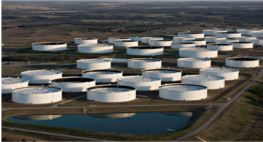
Picture 12. Tank farm