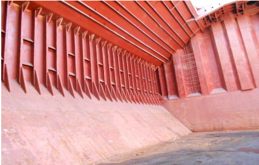
Picture 9. Hold on dry bulk vessel