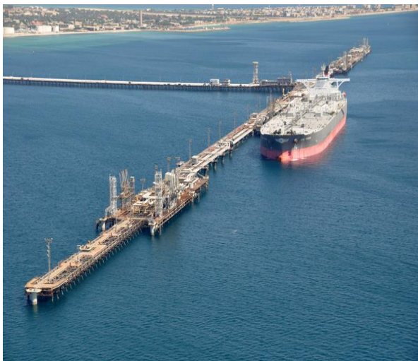
Picture 14. Jetty

As ships became larger in size, port infrastructure struggled to keep the step. The length of the dock and the depth of the sea in the port were limiting factors for accommodating large vessels. This is why some smaller ports are equipped with offshore terminals. Those are made as mooring buoys. They are connected to the tank farm at the shore by means of submerged pipes. Once the vessel is moored to the buoy, flexible cargo hose is connected to the ship's manifold. At the conventional quay, pier or jetty, shore pipe lines connected to the ship's manifold using loading arms of flexible cargo hoses. Loading arms are essentially telescopic steel pipes with swivel joints. They are designed to tolerate slight ship movement during cargo handling operation [17].