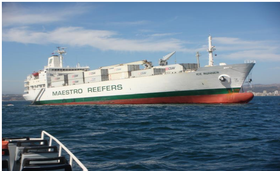
Picture 6. Reefer vessel

The difference between these two is in their equipment. Ships for cooled cargoes, in addition to refrigeration equipment, are also fitted with ventilation units. They are also provided with double skinned flooring which allows air circulation. Within this group, banana vessels are most specialized. These are fast ships, usually painted white and equipped with doubled refrigerating equipment, for safety [4].