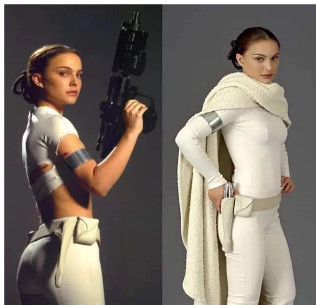
Figure 3: Padme’s jumpsuit before and after her love declaration.