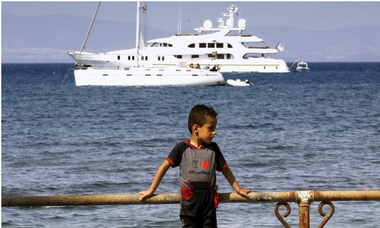
A young Syrian refugee in the Greek island of Kos.

Hammond said that the migrants would speed the collapse of the European social order. In reality, the number of migrants to have arrived so far this year (200,000) is so minuscule that it constitutes just 0.027% of Europe's total population of 740 million. The world's wealthiest continent can easily handle such a comparatively small influx.