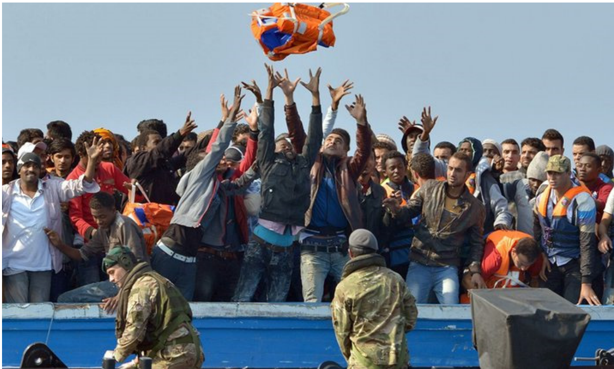
Royal Marines with migrants rescued off the Libyan coast in June.

In the dog-whistle rhetoric of Hammond and Theresa May, the archetypal contemporary migrant in Europe is from Africa. But again, that's not true. This year, according to UN figures, 50% alone are from two non-African countries: Syria (38%) and Afghanistan (12%). When migrants from Pakistan, Iraq and Iran are added into the equation, it becomes clear that the number of African migrants is significantly less than half. Even so, as discussed above, many of them – especially those from Eritrea, Darfur, and Somalia – have legitimate claims to refugee status.