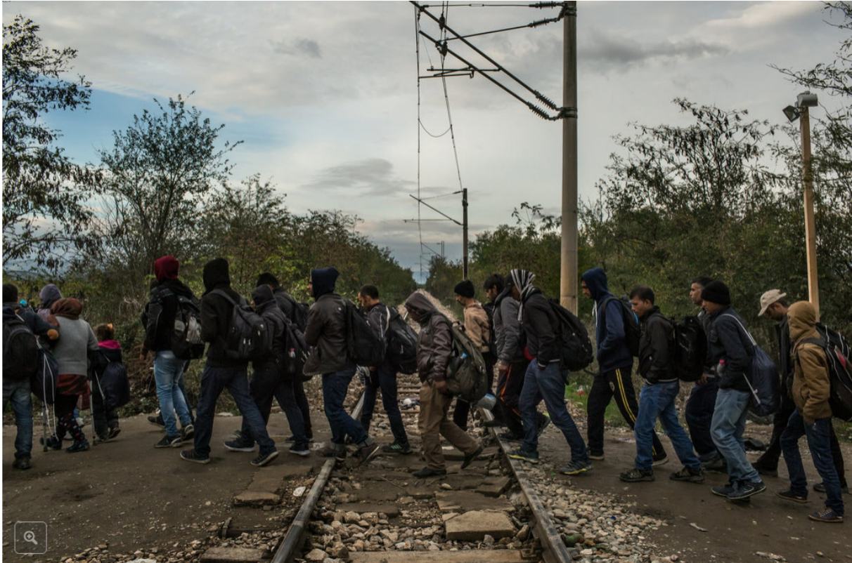
Migrants in Gevgelija, Macedonia, made their way across the border with Greece in October.