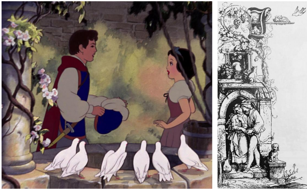
Fig. 1 Ludwig Richter's illustration for Beschaulischen und Erbaulichen (right) inspired the sequence in which Snow White and the Prince meet for the first time by the wishing well. From Allan, Robin. Walt Disney and Europe: European Influences on the Animated Films of Walt Disney . 1999. London. Print.

beau. Furthermore, Robin Allan (30) mentions several other similarities including the Prince's romantic attire featuring jerkin, short sword, and a cap with a feather, doves serving as messengers between the Prince and Snow White, and one inevitable element – an old lady observing the scene from her nook, which probably inspired animators for the way the angry Evil Queen jealously observes her stepdaughter from the window of her chamber.