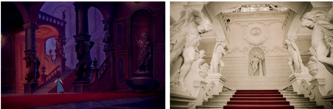
Fig. 11. Staircases in the Beast's castle (left) and in the Winter Palace of Prince Eugene in Vienna (right) look almost the same.

Other than nature, the Beast's castle represents another quintessential setting of the entire film in which the audience follows the development of the protagonists' relationship. As it was previously mentioned, architecture, as well as all the other aspects of the set design, only inspired animators to create their own imaginary world. Still, many architectural elements were taken from both French Renaissance and Baroque architecture. During their trip in France in 1989, animators visited the Renaissance château of Chambord the grandeur