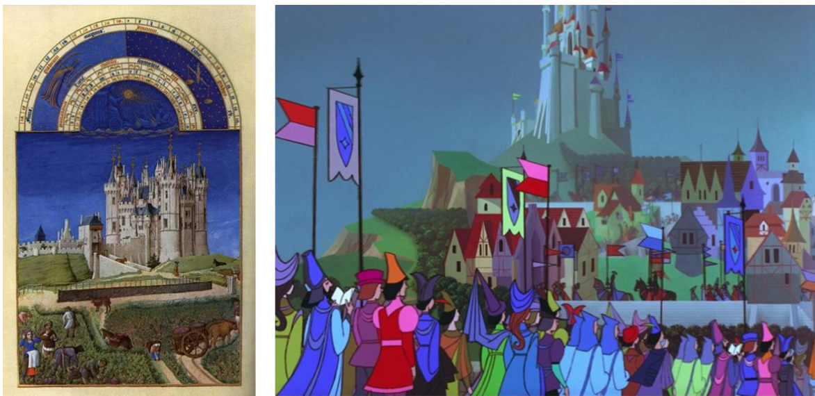
Fig. 6. Limbourg brothers' gothic illustrations (left) inspired the scene showing the procession honoring the newly born princess Aurora (right). From Limbourg brothers. Septembre . 1412-1416. Musée Condé. Chantilly. www.wga.hu . Web. 23 October 2015.

characteristic for previously mentioned illuminated manuscript, suited perfectly the new Disney style which had to compete with the UPA modernist style based on paintings by contemporary artists like Paul Cezanne, Pablo Picasso, Paul Klee, Henri Matisse, etc. Eyvind Earle also adopted the principles in rendering space, which is the reason why one can actually tell what is the foreground and what is the background, unlike in other animated features where backgrounds seem to be a bit messed up and entangled (Solomon Once 31). Thirdly,