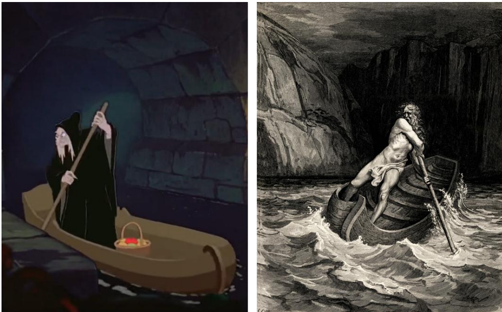
Fig. 2. Visual concept of the Evil Queen dressed up as Witch leaving the castle in a boat (left) was developed on one of Gustave Doré's illustrations of Dante's Inferno (right). From Doré, Gustave. Illustration to Dante's Divine Comedy . c.1855. Various Collections. www.wga.hu . 23 October 2015.

lovely bosquet filled with friendly forest animals. Here we can see how Disney combines duality between European art and American reality in the form of North American flora and fauna. Another Gustave Doré's illustration from Dante's Inferno served as a template for one of the scenes from the film – the one with the Evil Queen dressed up as Witch leaving the castle in a boat (see fig. 2). Some of the uptight gestures from Gustave Doré's illustration, and his expressive atmosphere were successfully transmitted onto the silver screen: a hunched old hag with her thin and scrawny hands grabbing a paddle and setting out into the mist, with only one aim so easily readable from her spiteful gaze – to kill the Fairest of Them All. Apart