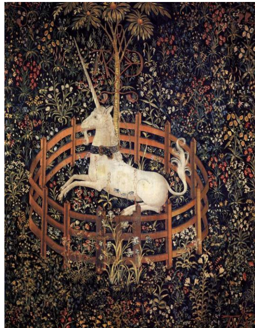
Fig. 5. Gothic narrative tapestry representing the hunt of a unicorn. From Unknown weaver. The Unicorn in Captivity . 1495-1505. Metropolitan Museum of Art. New York. www.wga.hu . Web. 23 October 2015.