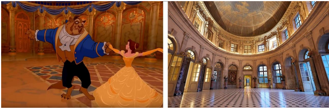
Fig. 12. The Beast's ballroom (left) resembles the structure of the Grand Salon of the Château Vaux-le-Vicomte in France (right). From Le Vau, Louis. Vaux le Vicomte. 1658-1661. Maincy, France. www.vaux-le-vicomte.com . Web. 23 October 2015.

Prince Eugene in Vienna, Austria, surprisingly resembles the staircase of the Beast's grand foyer (see fig.11). Four symmetrically arranged monumental sculptures of beasts holding the staircase construction correspond to the four Atlants holding the staircase construction in the Viennese Palace designed by the Austrian Baroque architect Fischer von Erlach. Not only does the animated staircase imitate the original Baroque construction, but the sculptures of the beasts follow the torsion of the muscular Atlants' bodies caused by the pressure of the lavish Baroque architecture. The pathos on their faces, frequent in Baroque sculpture, suits well the agony and punishment Beast carries on his shoulders, similar to the mythical Atlantes punished to eternally hold the sky on their shoulders.