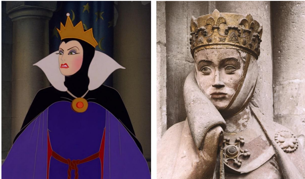
Fig. 4 Animators found inspiration for the Evil Queen (left) in the portrait of Lady Uta from the Naumburg Cathedral (right). From Naumburg master. Twelve donor portraits . 13 th ct. Naumburg Cathedral. Germany. Private collection.

White's fragile look to her stepmother's fierce look based on another Gothic sculpture. Animators found inspiration for this bold, but painfully beautiful female antagonist in the portrait of Lady Uta from the Naumburg Cathedral (see fig. 4). Uta is just one out of the 12 life-sized figures which the unknown sculptor, named the Naumburg Master, endowed with individual characteristics in the manner no earlier master had achieved ever before (Geese in