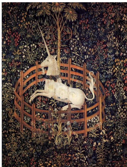
Fig. 5. Gothic narrative tapestry representing the hunt of a unicorn. From Unknown weaver. The Unicorn in Captivity . 1495-1505. Metropolitan Museum of Art. New York. www.wga.hu . Web. 23 October 2015.