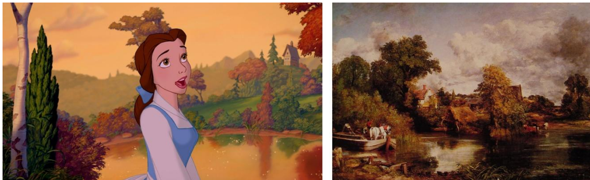
Fig. 10. The Romanticist landscape similar to the one on John Constable's 1819 The White Horse (right) can be seen in some of the sequences of Beauty and the Beast . From Constable, John. The White Horse . 1819. Frick Collection. New York. USA. www.artdigit.com . Web. 23 October 2015.

After the initial dark visual style was left for good, animators went for a softer and more romantic version suitable for the musical adaptation of one of the most beautiful love stories ever told. Although the research trip enabled the creative crew to experience more intimately the setting they wanted to use as a template for the story, they ended up using it only as a source of inspiration in creating their own imaginary world. Works by two French Rococo painters François Boucher and Jean-Honoré Fragonard initially influenced the animators, but they eventually went the other direction (ibid. 120). Romanticist landscape painting seemed to be the most suitable source for the world they had imagined ( Tale as Old as Time: Making ). Unlike the Sleeping Beauty stylized and geometrical landscapes based on medieval manuscripts, the Romanticist landscape painting provided almost soft and misty