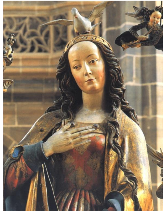
Fig. 3. Virgin Mary. From Stoss, Veit. Annunciation . 1517-1518. St Lorenzkirche. Nürnberg. Germany. Private collection.