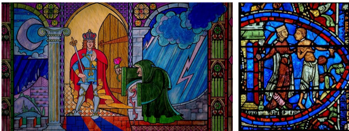
Fig. 9. The Beast's punishment was depicted at the beginning of the film in the form of a stained glass window (left). The same device was used during the Middle Ages to tell Biblical stories similar to this segment with the Prodigal son from the Cathedral of Chartres. From Unknown master. The stained glass windows . 1210. The Cathedral of Chartres. France. www.vidimus.org . Web. 23 October 2015.