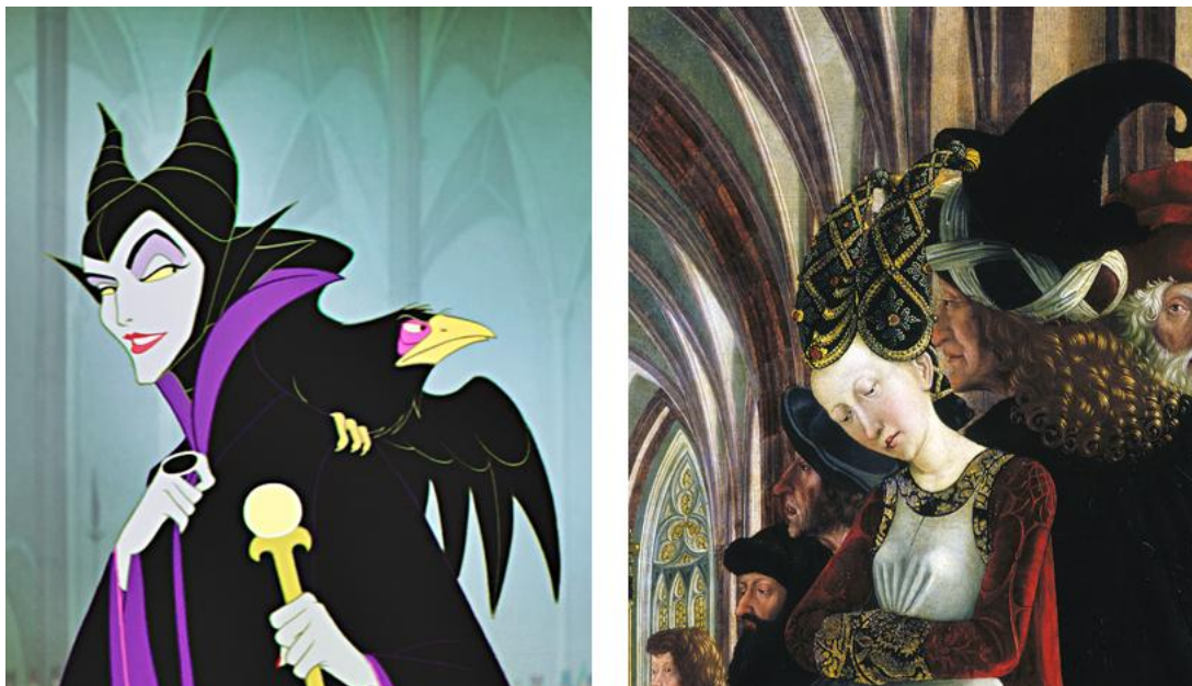
Fig. 8. A headdress similar to this one worn by the lady (right) on Michael Pacher's St Wolfgang Altarpiece (1479-1481) inspired Maleficent's visual appearance (left). From Pacher, Michael. St Wolfgang Altarpiece: Christ and the Adulteress . 1479-1481. Parish Church. Sankt Wolfgang, Austria. www.wga.hu . Web. 23 October 2015.

four. Three good fairies Flora, Fauna and Merryweather give a sense of comic relief, while the fourth one, Maleficent, provides the element of horror. Her character of an independent, fierce, strong lady was built on the legacy of the Evil Queen from Snow White and the Seven Dwarfs , as they are both gorgeously dangerous, and impeccably nightmarish. Sometimes her character might seem even more important than all the others, mainly because she, in contrast to Perrault's story, starts all the action in storyline, from arriving to Princess Aurora's