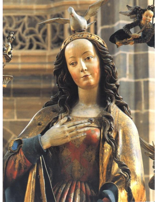
Fig. 3. Virgin Mary. From Stoss, Veit. Annunciation . 1517-1518. St Lorenzkirche. Nürnberg. Germany. Private collection.