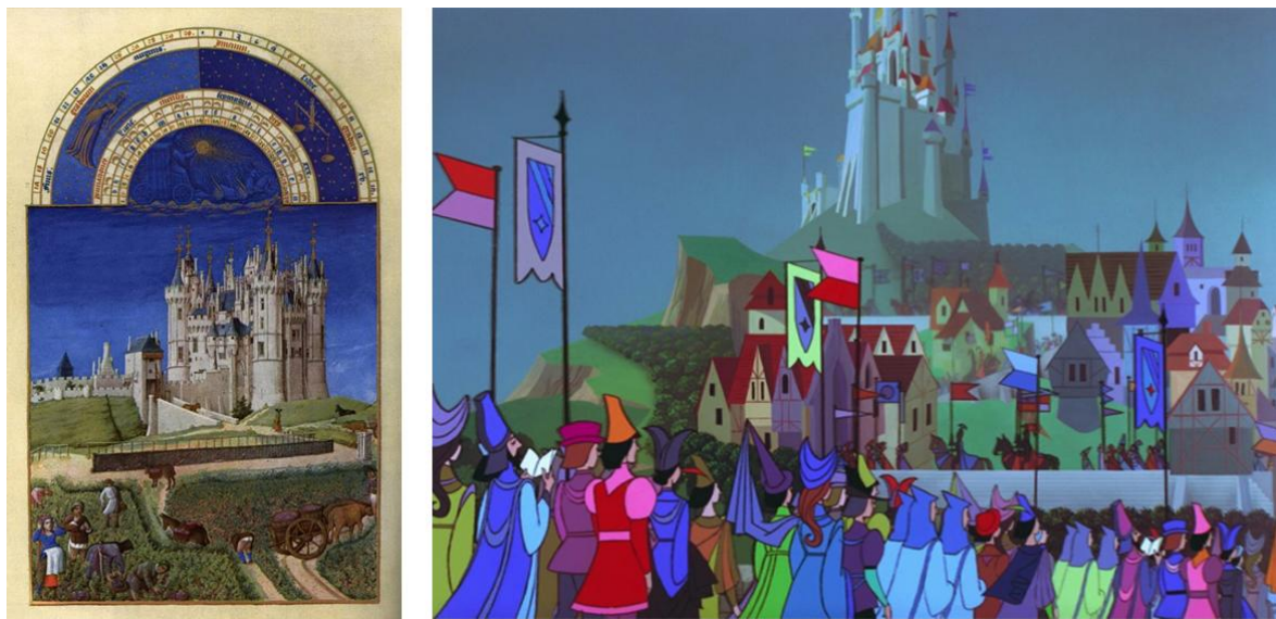
Fig. 6. Limbourg brothers' gothic illustrations (left) inspired the scene showing the procession honoring the newly born princess Aurora (right). From Limbourg brothers. Septembre . 1412-1416. Musée Condé. Chantilly. www.wga.hu . Web. 23 October 2015.

characteristic for previously mentioned illuminated manuscript, suited perfectly the new Disney style which had to compete with the UPA modernist style based on paintings by contemporary artists like Paul Cezanne, Pablo Picasso, Paul Klee, Henri Matisse, etc. Eyvind Earle also adopted the principles in rendering space, which is the reason why one can actually tell what is the foreground and what is the background, unlike in other animated features where backgrounds seem to be a bit messed up and entangled (Solomon Once 31). Thirdly,