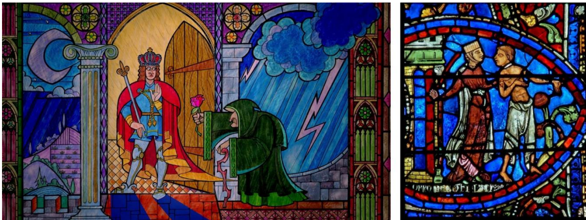
Fig. 9. The Beast's punishment was depicted at the beginning of the film in the form of a stained glass window (left). The same device was used during the Middle Ages to tell Biblical stories similar to this segment with the Prodigal son from the Cathedral of Chartres. From Unknown master. The stained glass windows . 1210. The Cathedral of Chartres. France. www.vidimus.org . Web. 23 October 2015.