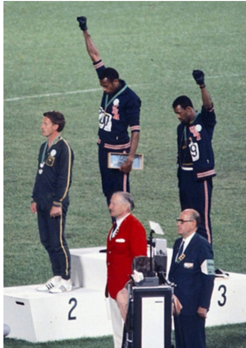
Image 3: Gold medalist Tommie Smith (center) and bronze medalist John Carlos (right) showing the raised fist on the podium after the 200 m race at the 1968 Summer Olympics

struggle which they endure throughout life and how they expressed themselves through sport, where due to their talent, they were only then seen as “real” Americans.