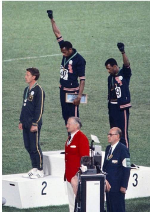
Image 3: Gold medalist Tommie Smith (center) and bronze medalist John Carlos (right) showing the raised fist on the podium after the 200 m race at the 1968 Summer Olympics

struggle which they endure throughout life and how they expressed themselves through sport, where due to their talent, they were only then seen as “real” Americans.