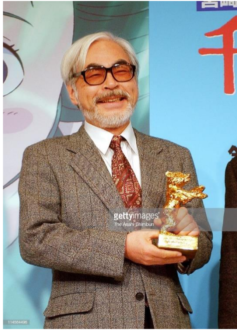
Hayao Miyazaki at the 52 nd Berlin International Film Festival. Getty Images, 2002.

Then started the screening of "Howl's Moving Castle", which was awarded the Osella Award at 61 st Venice International Film Festival. After the release, Hayao travelled to France and Britain for publicity campaigns.