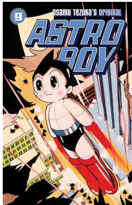
Tezuka, Osamu. "Astro Boy (Book 9)." Dark Horse Manga, 2002

The end of the 20 th century is recognised as "the golden era of anime". The 1980s marked the time when Japanese animation gained enormous popularity producing anime of robot, cyberpunk and space opera genres. The "Dragon Ball Z" series and the post-apocalyptic film "Akira" that emerged from this period are some of the best examples of Japanese animation. During these years, Hayao Miyazaki founded Studio Ghibli along with Isao Takahata and introduced the world to some of anime classics, such as "Nausicaä of the Valley of the Wind" and "Grave of the Fireflies".