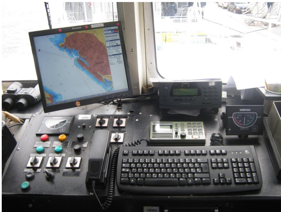
Picture 9. ECDIS - Catamaran Olea

„Electronic chart display and information system (ECDIS) means a navigation information system which, with adequate back-up arrangements, can be accepted as complying with the up-to-date chart required by regulation V/20 of the 1974 SOLAS Convention, by displaying selected information from a system electronic navigational chart (SENC) with positional information from navigation sensors to assist the mariner in route planning and route monitoring, and by displaying additional navigation-related information if required.“ [7]