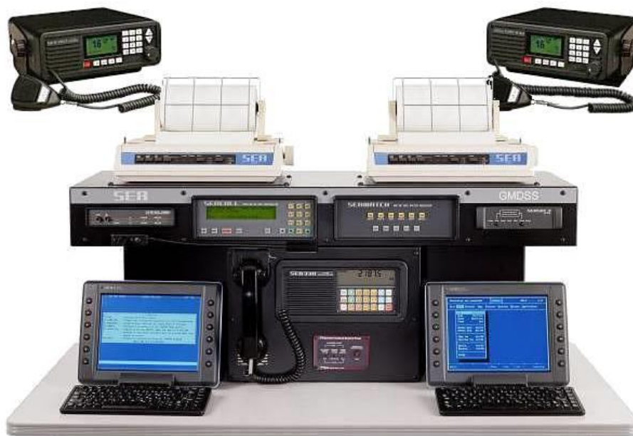
Picture 8. GMDSS

However, if disaster overwhelms a vessel before an alert can be initiated, a float-free satellite EPIRB is automatically released and activated. This alert is received and decoded by the polar orbiting COSPAS-SARSA T satellites with a subsequent link into the GMDSS radionet.“ [6]