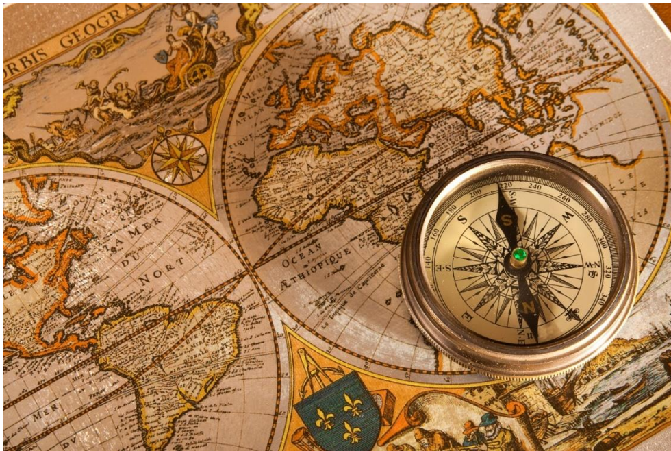
Picture 1. Compass and map

Navigation is in fact the art of directing vessels through water and establishment of its positions and courses by means of astronomy, geometry or special navigational instruments. One of the oldest and earliest navigational tool used was mariner's compass. It was used when the Sun was not visible. The compass was an early form of magnetic compass. It was often innacurate and incosistent because of magnetic variation, which was not understood at that time. Nautical charts were introduced during the mid-thirteenth century. Mariners had realised it would be helpful if they kept detailed record of their voyages. There were no latitude or longitude labeled on chart, but there was a compass rose which indicated the direction.