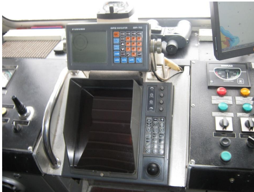
Picture 10. GPS - Catamaran Olea