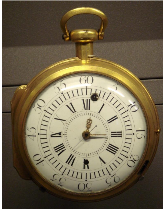
Picture 3. Chronometer

The gyroscopic compass was introduced in 1097. The gyro compass is unaffected by ship's or Earth's magnetic field and always points to true north. In 1935 the Radar was introduced. Radar stands for „Radio detection and ranging“. Its primary purpose is locating objects beyond range of vision. The Loran was developed during 1940s. This navigation system stands for Long Range Navigation. It uses pulsed radio transmission from so called „master“ and „slave“ stations to determine a ship's position. Loran is accurate but its coverage is limited. On most vessels Loran was replaced in the late twentieth century by global positioning system, known as GPS. Its principle of work is similar to Loran but it uses signals from a satellite.