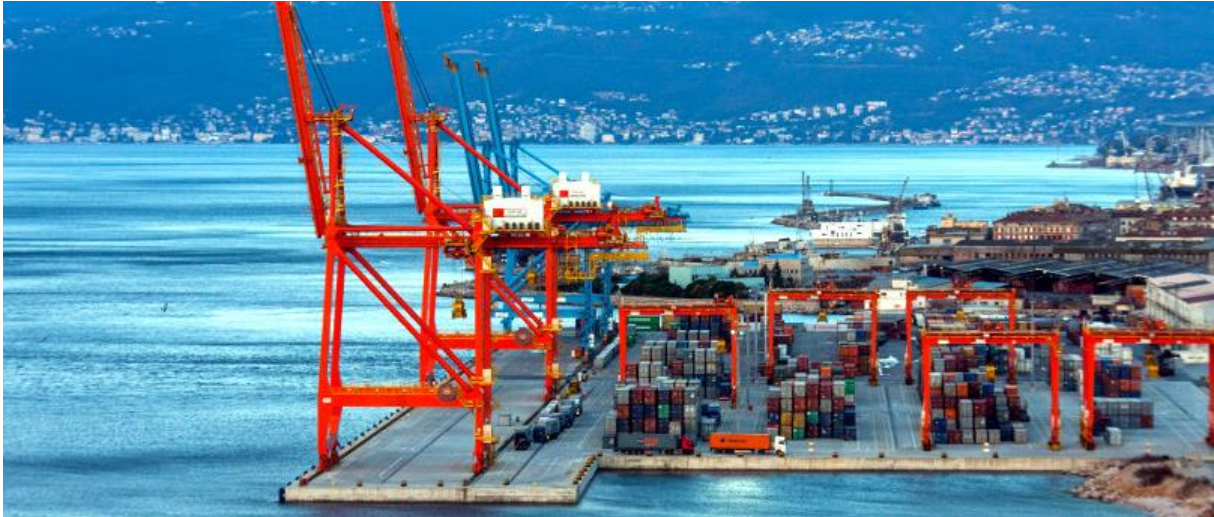
Figure 2. Port of Rijeka

Rijeka port is also a dry port because it has direct rail connection with the center for the transshipment of sea cargo. As approaching coast and port, the ship's pilot has to report her ETA arrival. Port authorities use Vessel traffic service (VTS) which operates as an air traffic control for aircrafts. In order to secure safe sea traffic, VTS is used by trained professionals who perform required tasks. One of the tasks is monitoring vessels that are approaching and telling their crew what to do in favor of faster arriving and departing from the port. Therefore, ship's pilot is communicating with local port authorities with the help of radio communication systems, while defining vessel's position and its course with the help of radar. Entire procedure is explained in the next few chapters.