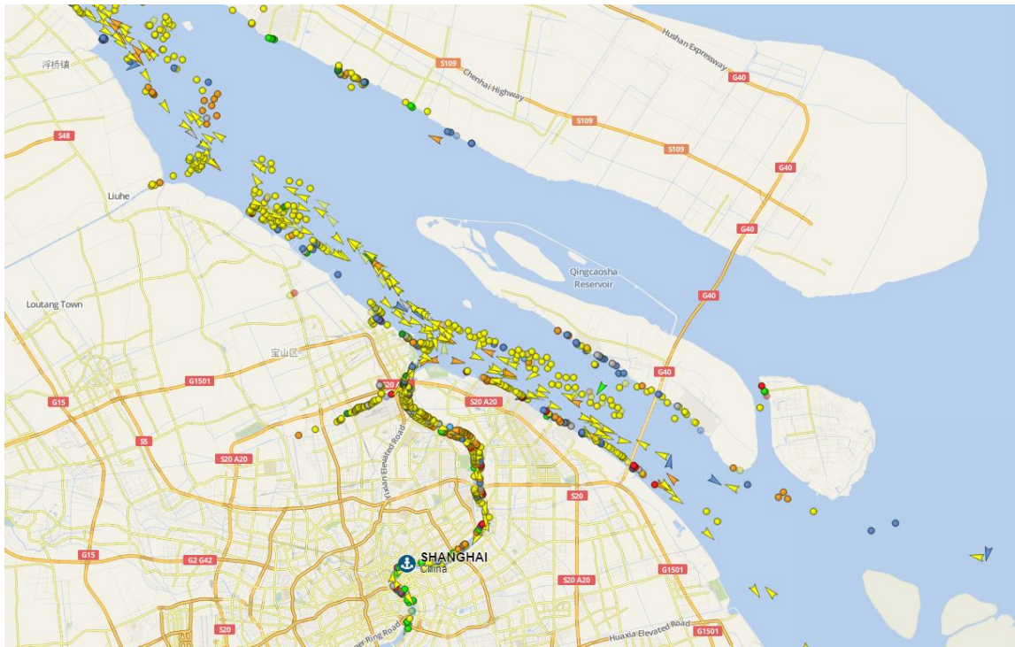
Figure 6. Vessels in near of port of Shanghai

safety while optimizing productivity. Every category of procedure has its purpose and tends to simplify the process while informing vessels rule of conduct, especially taking care of serious situations and vessels that should be treated with special care.