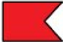
Figure 5. Red code flag that in international code means that vessel is taking in, or discharging, or carrying dangerous goods (source: http://www.otenmaritime.com/flag-signals/flag-table )

Specified vessels in this case are ships that transport dangerous cargo. There are all sorts of dangerous cargo, but in this case port authorities of London defined them as vessels which carry explosives, flammable or toxic substances. As one can notice they must have a visible red flag during the day and an all-round 22 red light during the night. There is an obvious reason for this practice, and the reason is safety. It would be careless to leave vessels with dangerous cargo unmarked, therefore every other vessel near it could not notice potential danger and act accordingly.