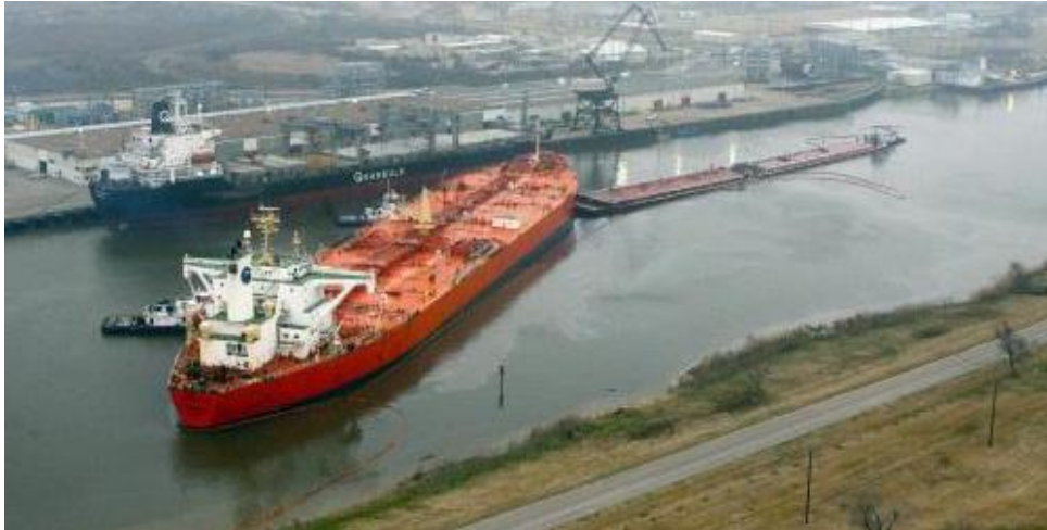
Figure 7. Collision of two ships in Texas port

Figure 7. shows collision of two ships which resulted with spilling as much as 450,000 gallons of crude oil in June 2010. 25