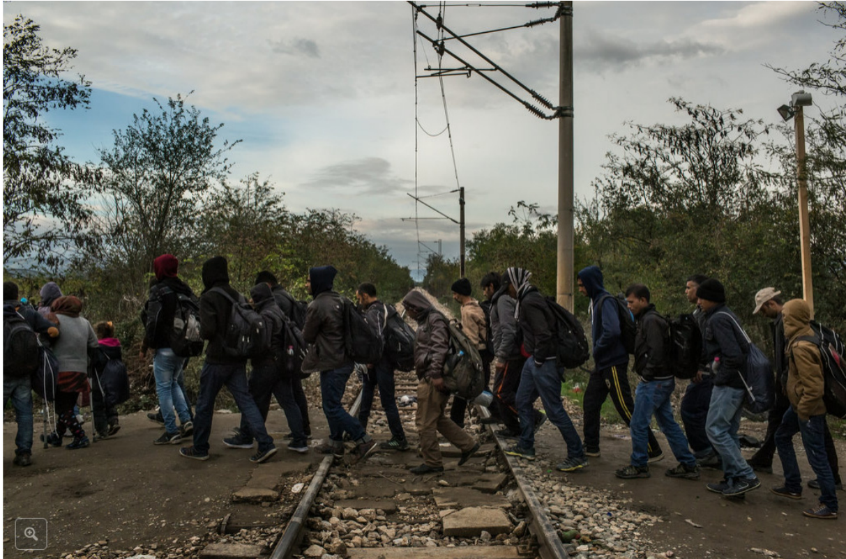
Migrants in Gevgelija, Macedonia, made their way across the border with Greece in October.