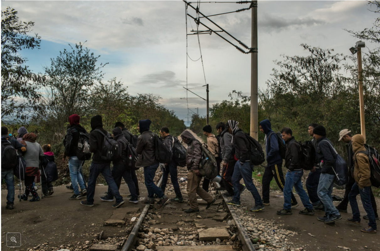
Migrants in Gevgelija, Macedonia, made their way across the border with Greece in October.