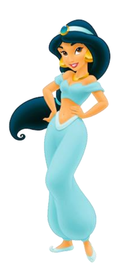
Fig. 6. Princess Jasmine

and Jasmine as a person who has the will of others put on her). Jasmine is fighting alongside Aladdin so she can have freedom and ability to choose against a backwards society with their old customs. However, she is not presented as a strong character in the movie, same as all the other women. They are seen as beautiful, exotic and sexual things. The women (Jasmin included) are shown as scantly clothed and wearing clothes that reveal their stomach while also wearing veils to cover up their faces. This only serves to sexualise them and does not