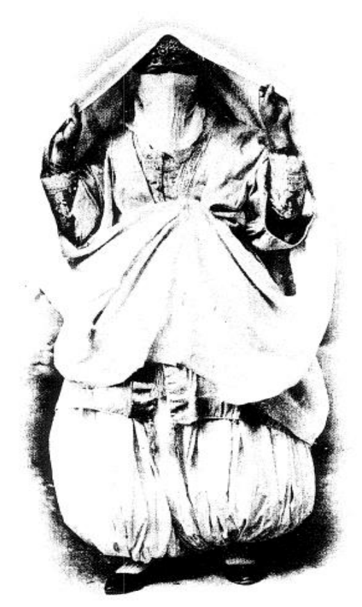
Fig. 1. Alloula, Malek. Moorish woman taking a walk

view of the East as exotic, mysterious and unknown was also accompanied by the West seeing them as backward, with the customs, people, technology and the way of life in the East being vastly inferior to the West. Western authors cared very little for the plight of the common man and the way of life of the regular people.