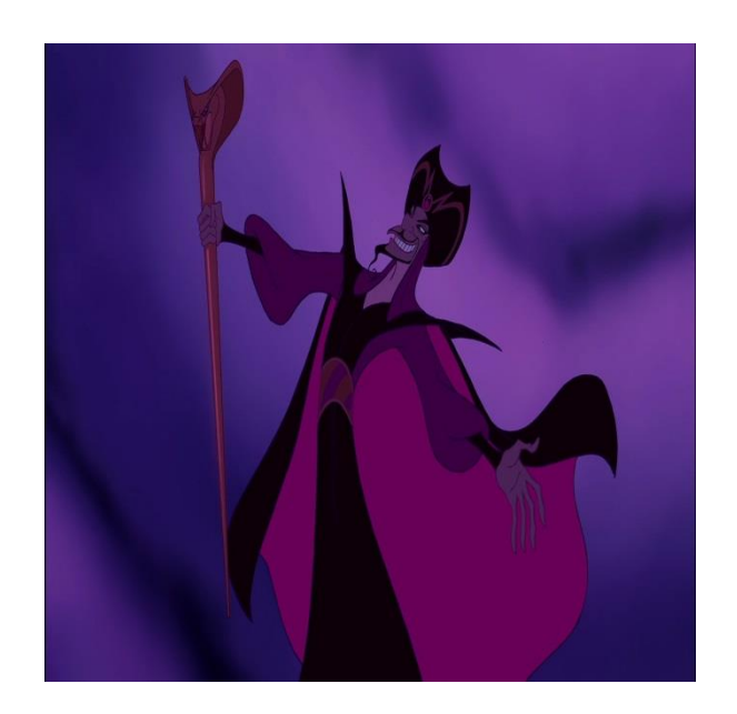
Fig. 4. Aladdin Fig. 5. Jafar

character as a "good guy", his thievery is justified when he offers not to eat this bread and instead give it to the poor children who are searching trash.