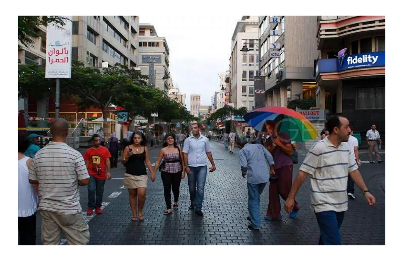
Fig. 7. Hamra Street in Beirut