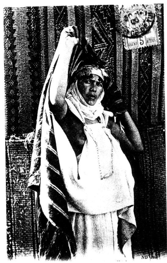
Fig. 2. Alloula, Malek. Kabyl woman covering herself with the haik

The people living in what was perceived as the Orient were made to look exotic and mysterious. Not because that is what they were but because that was what the European powers wanted or thought them to be. Photographs were set up in special studios designed to make the Arab women look exotic, backwards and strange. This was a Western man could