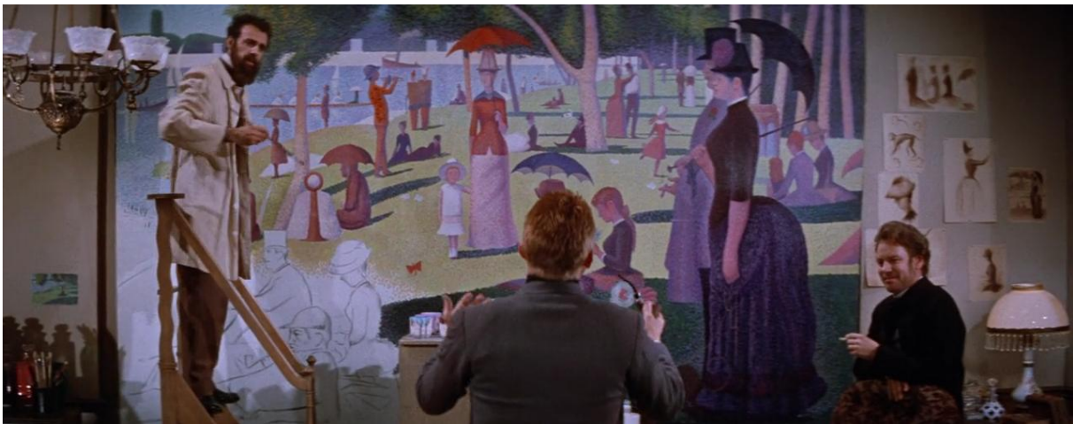
Figure 6 Still from Minelli, Lust for Life (51:14)