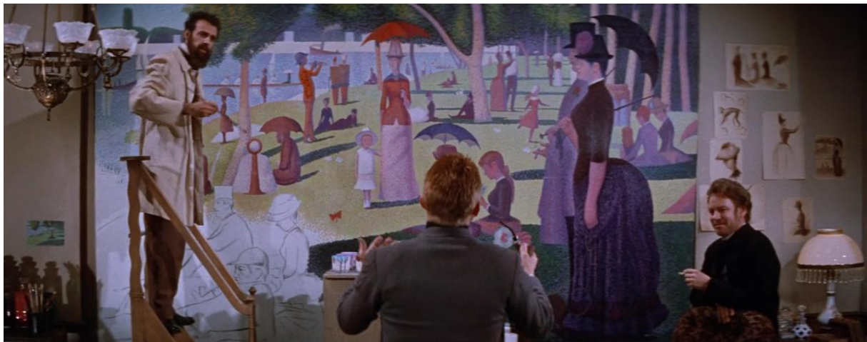
Figure 6 Still from Minelli, Lust for Life (51:14)