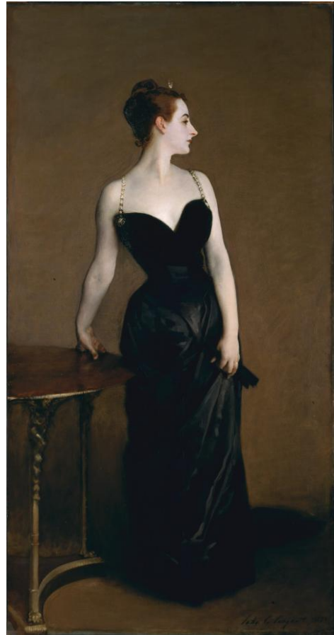
Figure 11 Singer Sargent, John. Madame X . 1883-1884, The Metropolitan Museum of Art, "The Metropolitan Museum of Art , The Metropolitan Museum of Art, www.metmuseum.org/art/collection/search/20012492 . Accessed 13 Jan. 2019.

sister, but also in a way the figures interact with the greenery and the rest of the setting of the park surrounding them. Later on, as the film progresses together with Gigi's training, we are introduced to a changed character whose newborn femininity and seductiveness that are to be demonstrated in an outing at Maxim's, match those of women portrayed by John Singer Sargent. Among those portraits that show certain similarities with Gigi's new grace are Madame X (1883-84), whose gown matches Gigi's in shape, though not in color (See Fig. 11), and Ena and Betty, Daughters of Mr. and Mrs. Asher Wertheimer (1901),