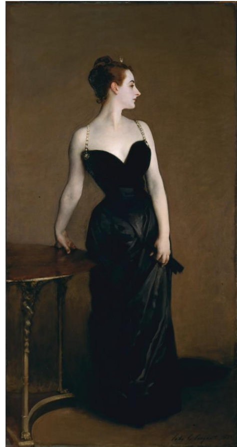
Figure 11 Singer Sargent, John. Madame X . 1883-1884, The Metropolitan Museum of Art, "The Metropolitan Museum of Art , The Metropolitan Museum of Art, www.metmuseum.org/art/collection/search/20012492 . Accessed 13 Jan. 2019.