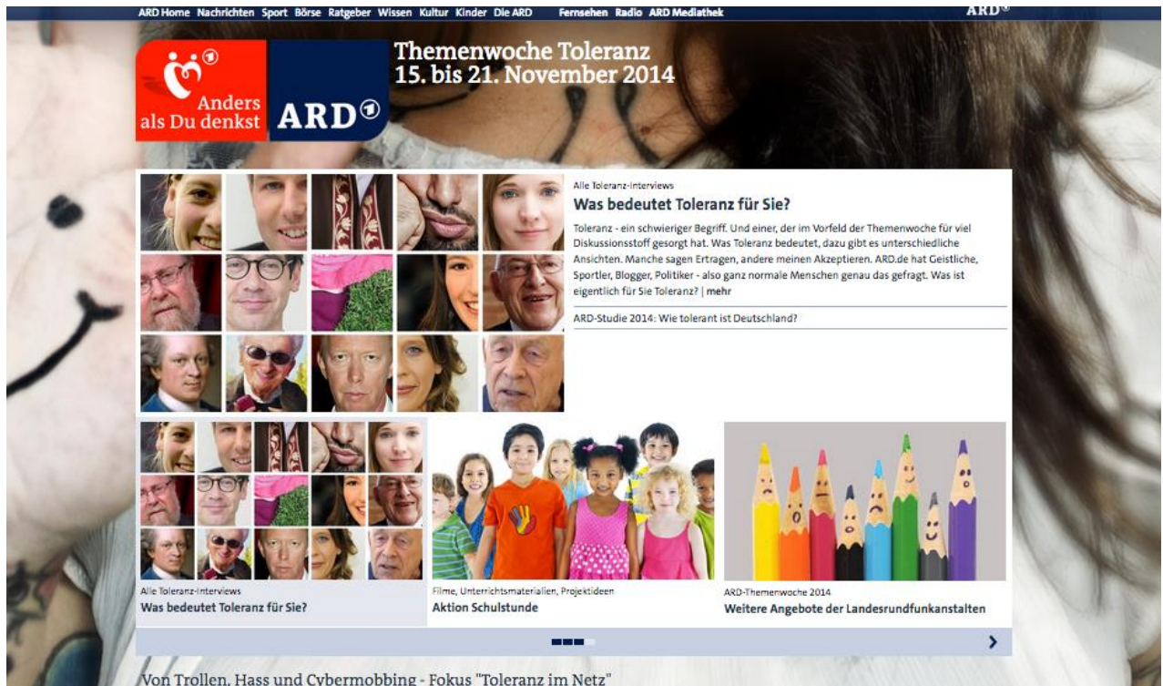
Fig. 6 – ARD Tolerance Week – ARD Themenwoche Toleranz – screenshot of the web page

In this context, the media undertook the role of instructing, showing tolerance to be the “rational,” “civilized” way of responding to people or phenomena deemed outside the social norm, while at the same time in individual media examples showing that even tolerance has and should have its limits. 75 Not only in the media channels, a school week on tolerance ( Aktion Schulstunde ) was organized parallel to the media week. All over Germany, primary school children and their teachers were invited to “deal with the different facets of tolerance,” because “children who learn early to be tolerant will profit not only in school, but in all life situations.” 76 The proclaimed objective of the school week was to offer tolerance as the response of choice in cases of contact with difference, as stated in the accompanying text: