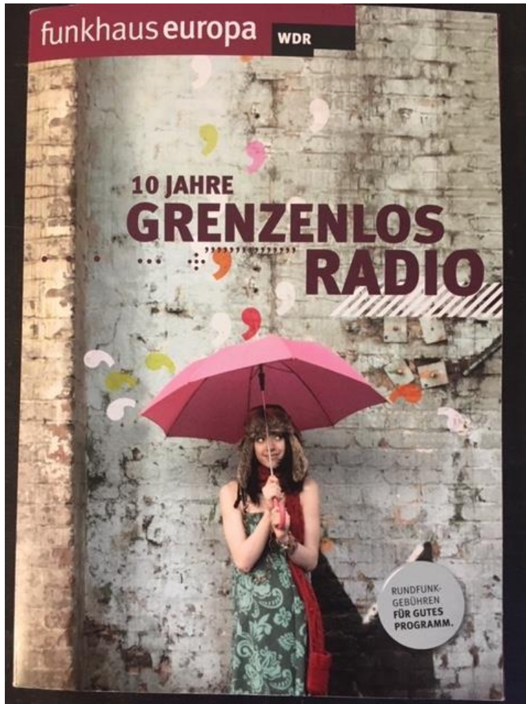
Fig. 2 – 10 Years Boundless Radio – 10 Jahre grenzenlos Radio – Funkhaus Europa brochure 2009

this person is of another origin, this leads to an especially high authenticity with our audience. If you want to put it in journalistic terms, it often brings another point-of-view into the reporting. Sometimes we do it differently on purpose and send a Turkish reporter into a Croatian pub or a German reporter into a Turkish coffee house, because when you are not so near the culture, you notice new and different things. (translation from German by the author)