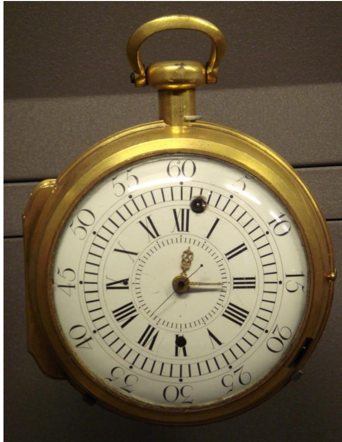
Picture 3. Chronometer

The gyroscopic compass was introduced in 1097. The gyro compass is unaffected by ship's or Earth's magnetic field and always points to true north. In 1935 the Radar was introduced. Radar stands for „Radio detection and ranging“. Its primary purpose is locating objects beyond range of vision. The Loran was developed during 1940s. This navigation system stands for Long Range Navigation. It uses pulsed radio transmission from so called „master“ and „slave“ stations to determine a ship's position. Loran is accurate but its coverage is limited. On most vessels Loran was replaced in the late twentieth century by global positioning system, known as GPS. Its principle of work is similar to Loran but it uses signals from a satellite.