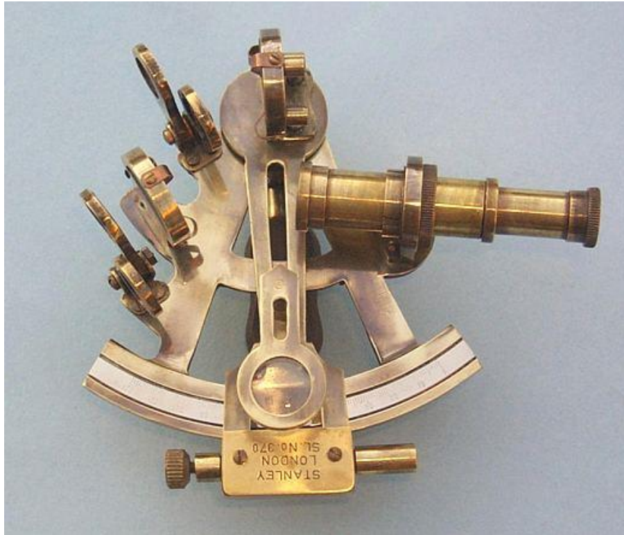
Picture 2. Sextant

The chip log was invented and used as a crude speedometer in the sixteenth century. The chip log was let out over the stern when ship was underway. It contained a line with regular interval knots. A mariner would count the number of knots that went out over precise time period and the ship's speed could then be calculated. The chronometer was invented by a British clockmaker John Harrison in 1764. It was made for precise and accurate determination of longitude by means of celestial navigation.