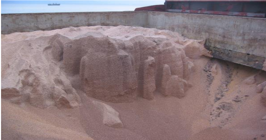
Picture 11. Moisture migration

introduction of water by the ventilation or by direct contact of the cargo with water. Swelling of the grain due to ingress of sea water can cause structural damage to the ship. Grain damaged by sea water becomes bitter and is no longer suitable for milling into flour [11].