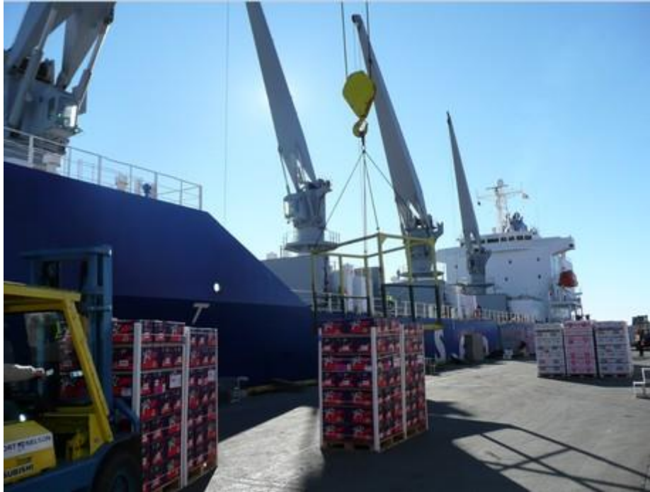
Picture 7. Loading palletized cargo