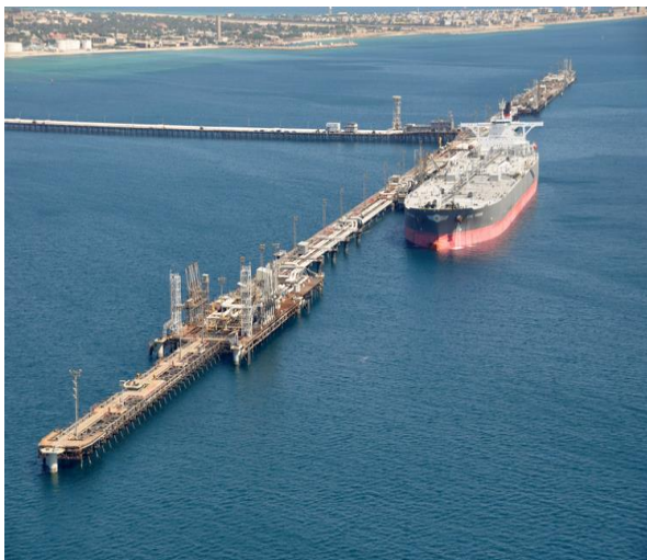
Picture 14. Jetty

As ships became larger in size, port infrastructure struggled to keep the step. The length of the dock and the depth of the sea in the port were limiting factors for accommodating large vessels. This is why some smaller ports are equipped with offshore terminals. Those are made as mooring buoys. They are connected to the tank farm at the shore by means of submerged pipes. Once the vessel is moored to the buoy, flexible cargo hose is connected to the ship's manifold. At the conventional quay, pier or jetty, shore pipe lines connected to the ship's manifold using loading arms of flexible cargo hoses. Loading arms are essentially telescopic steel pipes with swivel joints. They are designed to tolerate slight ship movement during cargo handling operation [17].