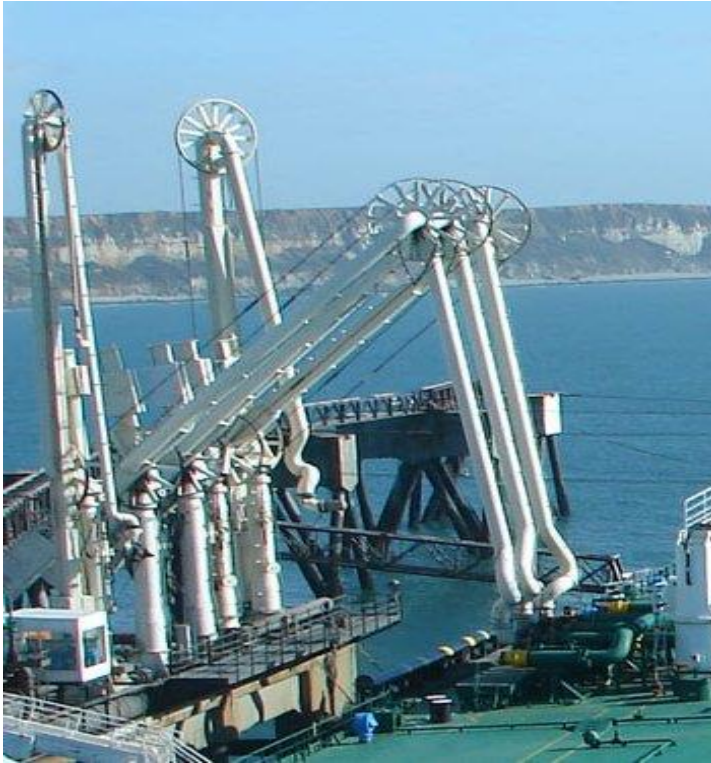
Picture 16. Marine loading arm

other problematic situation such as jammed valve. During loading, vent valves are opened. Air displaced from the tanks is released through the Mast riser, or sent ashore via vapor collection piping for processing. This method is known as closed loading operation [18].