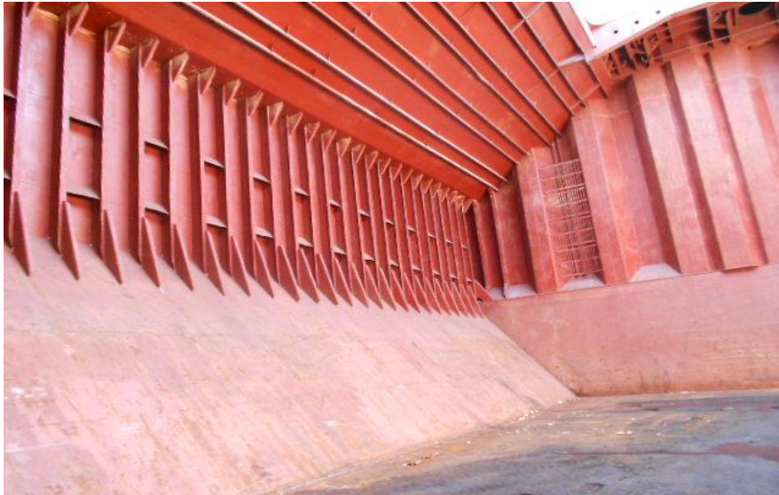
Picture 9. Hold on dry bulk vessel