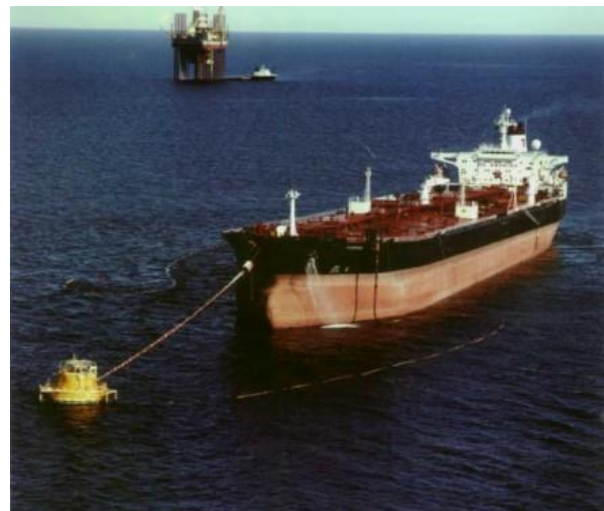
Picture 15. Single buoy mooring