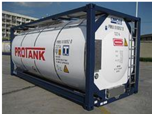
Picture 1. Tank container