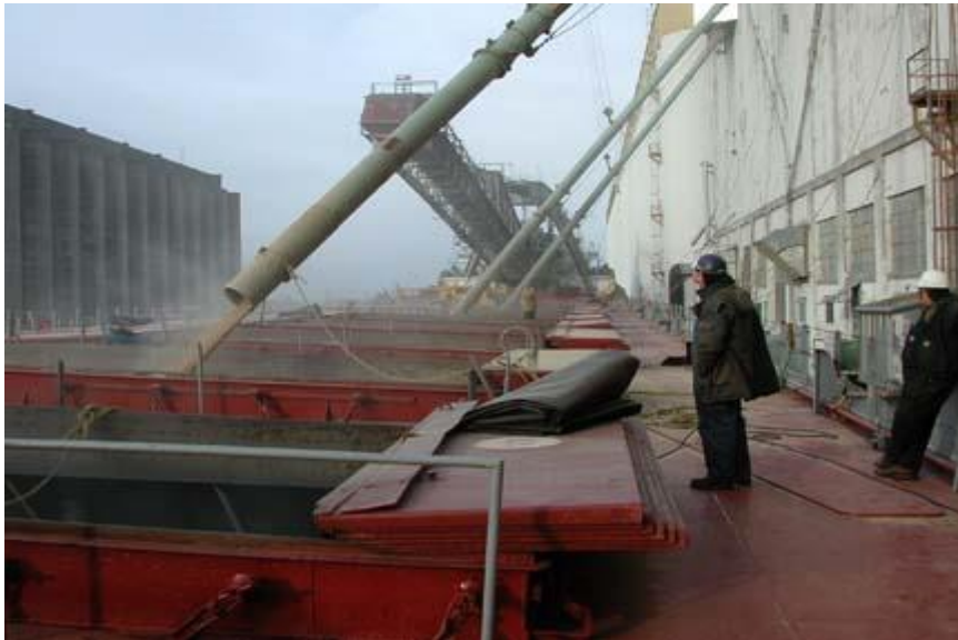
Picture 10. Grain loading

Grain cargo is loaded by ship loaders, which are metal structures equipped with the system of belts or chain conveyors. This system enables movement of the cargo through the structure into the loading spout. Slewing, pendulum, and hoisting motion of the spout, as well as the travelling motion of entire tower, enable it to reach entire width and length of the ship's holds. Dust is generated in the loading spout, because of friction between accelerated grain and the spout. This is the reason why dust suppressing units are fitted at the end of the pipe. When completing the holds, it is essential to direct the spout so that all corners of the hold are completely full. It is also good practice to let some time for the grain to settle and refill afterwards. This is important from stability point of view, as the cargo would start shifting if not loaded to the top.