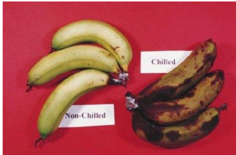
Picture 8. Chilling injury