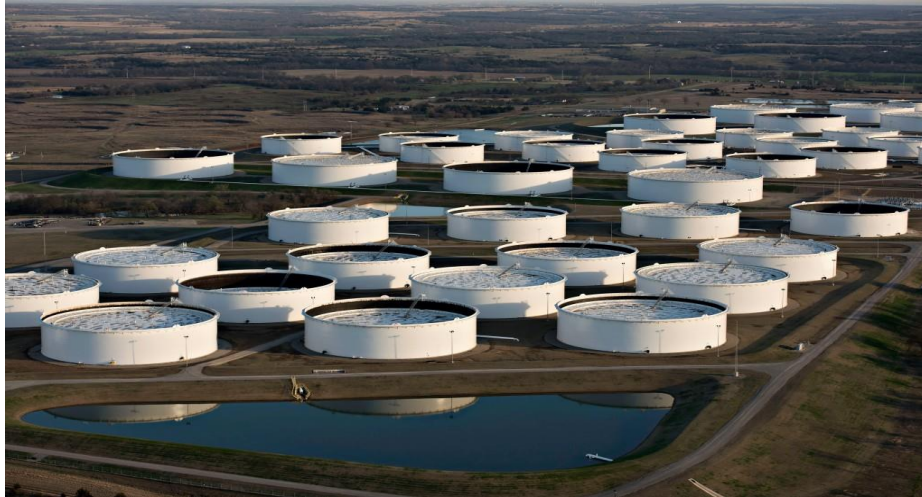
Picture 12. Tank farm