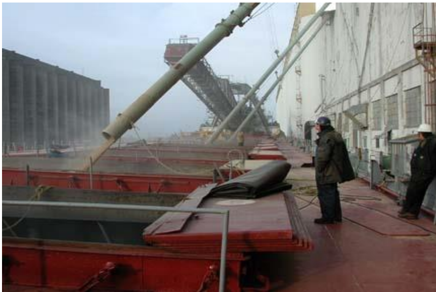
Picture 10. Grain loading

Grain cargo is loaded by ship loaders, which are metal structures equipped with the system of belts or chain conveyors. This system enables movement of the cargo through the structure into the loading spout. Slewing, pendulum, and hoisting motion of the spout, as well as the travelling motion of entire tower, enable it to reach entire width and length of the ship's holds. Dust is generated in the loading spout, because of friction between accelerated grain and the spout. This is the reason why dust suppressing units are fitted at the end of the pipe. When completing the holds, it is essential to direct the spout so that all corners of the hold are completely full. It is also good practice to let some time for the grain to settle and refill afterwards. This is important from stability point of view, as the cargo would start shifting if not loaded to the top.