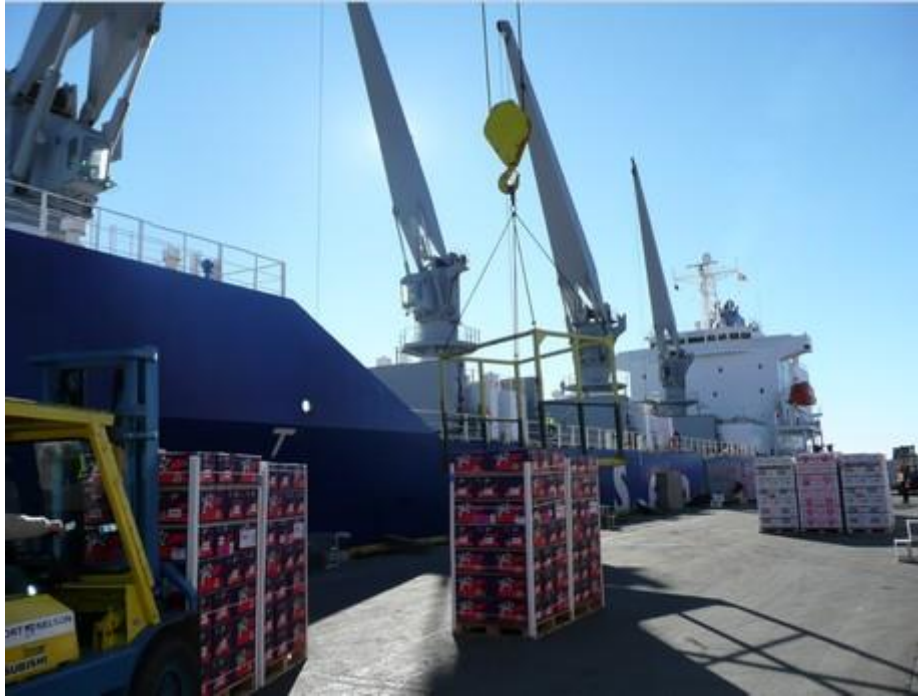
Picture 7. Loading palletized cargo