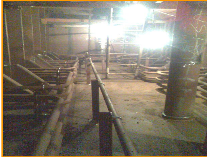
Picture 13. Steam heating coils

coils. Deck heaters are less popular system. Pumps are used to circulate the cargo through heat exchangers placed on the deck [12].