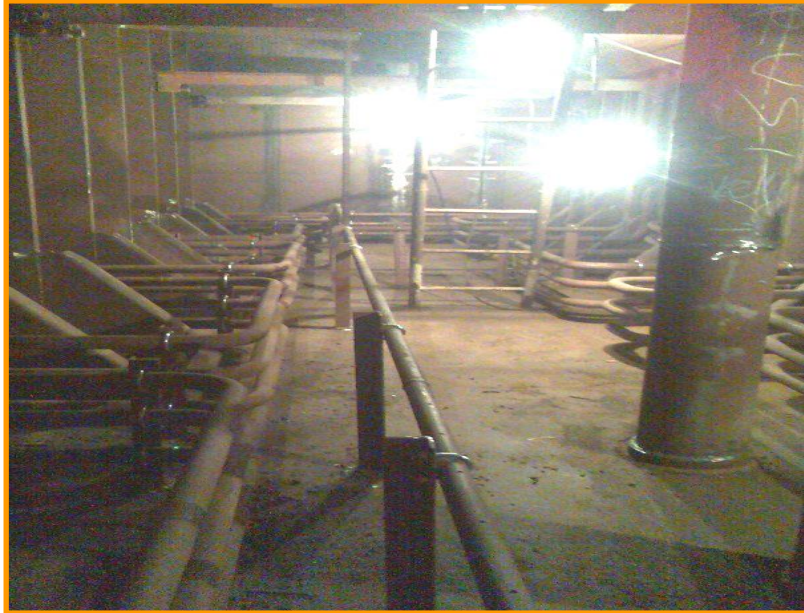
Picture 13. Steam heating coils

coils. Deck heaters are less popular system. Pumps are used to circulate the cargo through heat exchangers placed on the deck [12].