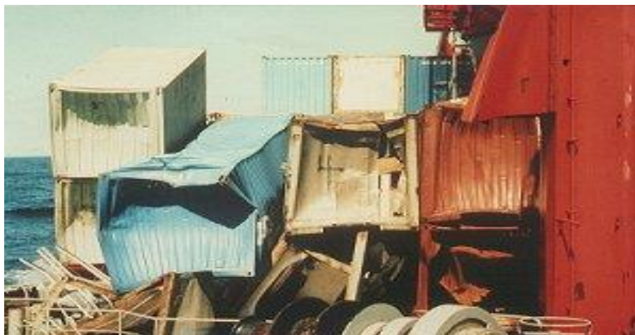
Picture 5. Cargo damaged by breaking wave impact

Cargo stored in container can become lost due to damage of the unit. The ones stowed on deck may experience breaking wave impact. The magnitude of this event makes it impossible to secure the load. Entire containers may break apart, and the content lost at sea. Due to extreme movement of the ship lashing gear may fail, and containers become lost. According to World Shipping Council surveys, in period from 2008 to 2013, it is estimated that there were 546 containers lost at sea each year, not counting catastrophic events [1].