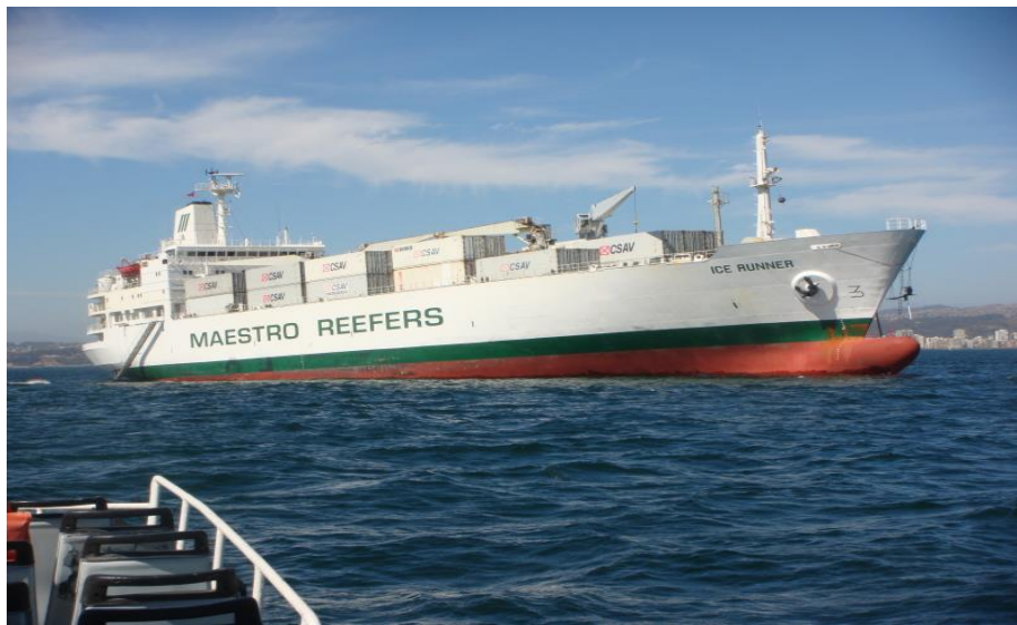
Picture 6. Reefer vessel

The difference between these two is in their equipment. Ships for cooled cargoes, in addition to refrigeration equipment, are also fitted with ventilation units. They are also provided with double skinned flooring which allows air circulation. Within this group, banana vessels are most specialized. These are fast ships, usually painted white and equipped with doubled refrigerating equipment, for safety [4].