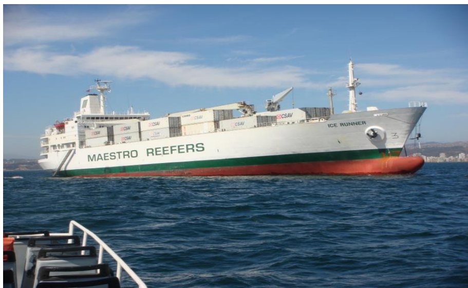
Picture 6. Reefer vessel

The difference between these two is in their equipment. Ships for cooled cargoes, in addition to refrigeration equipment, are also fitted with ventilation units. They are also provided with double skinned flooring which allows air circulation. Within this group, banana vessels are most specialized. These are fast ships, usually painted white and equipped with doubled refrigerating equipment, for safety [4].