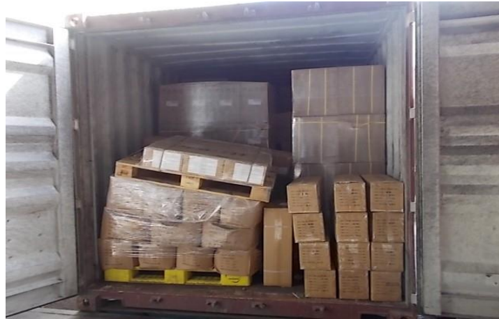
Picture 4. Poor cargo securing

Dunnage is a term used for materials which are not firmly attached to the cargo transport unit, the cargo or its package and are used to protect the load. This includes: wooden dunnage, beams, planks, boards, wedges, plywood, hardboards, walking boards, mats, paper, sailcloth, canvas, tarpaulins, plastic and metal sheets, spray covers, cardboard, paperboard, packing paper, oiled paper, inflatable bags... It is used to prevent movement of the cargo, to separate different types of goods and provide protection to the package as well [2].