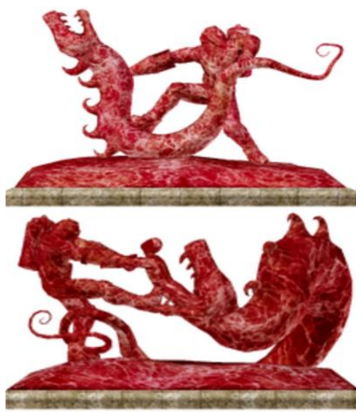
Figure 3. The comparison between the two choices regarding Gil Alexander, BioShock 2, 2010.

In BioShock 2 , we can observe how our choices shaped the art direction of the game in the form of statues that decorate the Rapture's halls. After the confrontation with Lamb, we take over the role of the Little Sister, seeing the world through her eyes. Their world is much more stylized and desensitized as opposed to their surroundings where blood trails are represented as rose petals, the splicers are people dressed in tuxedos, dresses, etc. Depending on what we decided to do with Gil Alexander, for example, he is either depicted as a snake monster fought by Delta or a man being pulled out of a snake (Figure 3). This further indicates the meta-narrative nature of the game.