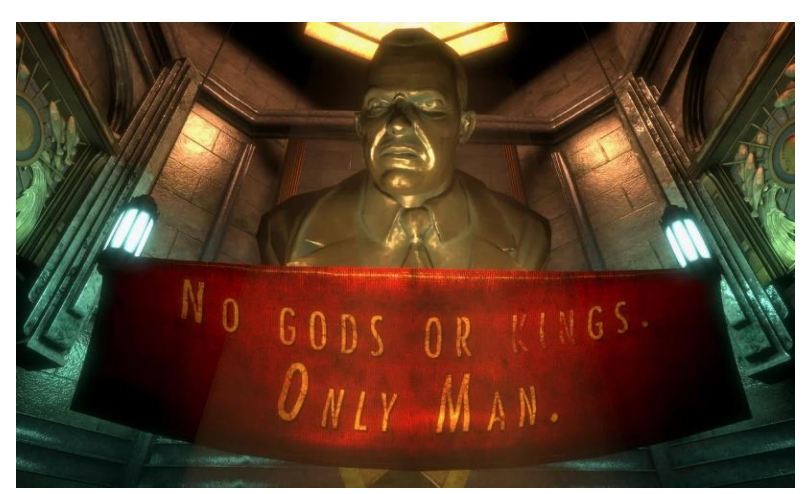
Figure 4. The statue of Andrew Ryan, BioShock, 2007.

The original BioShock , with its dark and brooding color palette, introduces the player to Rapture using almost all the horror elements it can think of. The door behind closes and as we turn around in the pitch-black darkness, the light suddenly turns on and we are confronted by the big and imposing statue of