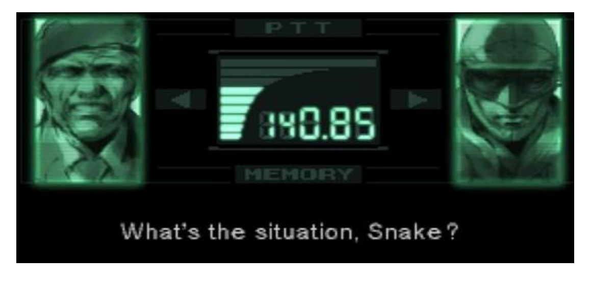
Figure 1. The Codec screen in Metal Gear Solid, 1998.

Fast forward to today, many game developers are still pushing boundaries when it comes to technical upgrades and finding ways to include innovative elements in their stories. From creating well-developed and complex characters, they also strived to build an environment that would allow the player the freedom and incentive to explore its vastness. Games such as Fallout New Vegas (2010) and Borderlands (2009) gave an open-ended gaming experience by having large expansive worlds, unique sets of characters, and specific art styles. This further verified the grand importance of storytelling and its undeniable presence in the modern gaming sphere with designers and creators even trying to improve the experience by smoothing over the fourth-wall-breaking factors in their titles to enhance the seamless fusion between gameplay and its story. Prince of Persia (2008) for example, indirectly guides the player on how to behave and accommodate to the game by mimicking the movements of the other characters during combat and chase scenes, purposefully avoiding any obtrusive moments that tell players what to do, allowing them to freely acquire knowledge through interactivity.