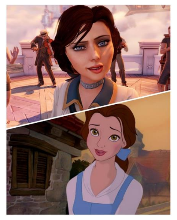
Figure 5. Similarities between Elizabeth and Belle

and Belle from Beauty and the Beast (Disney, 1991). In this twisted tale on her story, the beast is a mechanical monster called Songbird, Columbia's answer to the Big Daddies. Her design underwent multiple iterations, with the final product even visually resembling Belle with a