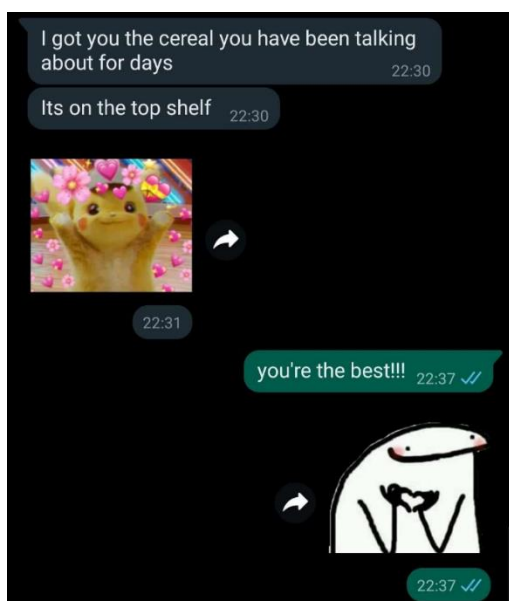
Picture 3. The sender says they got the receiver the cereal they have been talking about for days and put a positive sticker. The receiver excitedly replies and uses a positive sticker.