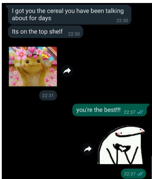
Picture 3. The sender says they got the receiver the cereal they have been talking about for days and put a positive sticker. The receiver excitedly replies and uses a positive sticker.