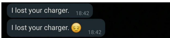
Picture 2. The first message contains the sentence “I lost your charger.” and the second has the same sentence with a frowning emoji.

In the survey, the participants were asked to pick between two messages, one including an emoji and the other one without: