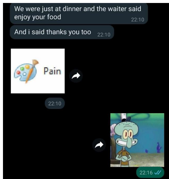
Picture 4. The sender explains they said thank you to the waiter with the ‘pain’ sticker. The receiver replies with an uncomfortable looking cartoon character with the same tone as the first sticker.

According to Markman and Oshima (2007), emoticons act as punctuating devices, in place or with punctuation marks which close the sentence off. Emoticons conclude the sentence by additionally supporting the sentence and approving the action executed by the text of the sentence. As well as defining the illocutionary force of the sentence, the emoticon provides a structure to the