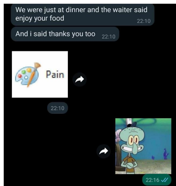
Picture 4. The sender explains they said thank you to the waiter with the ‘pain’ sticker. The receiver replies with an uncomfortable looking cartoon character with the same tone as the first sticker.

According to Markman and Oshima (2007), emoticons act as punctuating devices, in place or with punctuation marks which close the sentence off. Emoticons conclude the sentence by additionally supporting the sentence and approving the action executed by the text of the sentence. As well as defining the illocutionary force of the sentence, the emoticon provides a structure to the