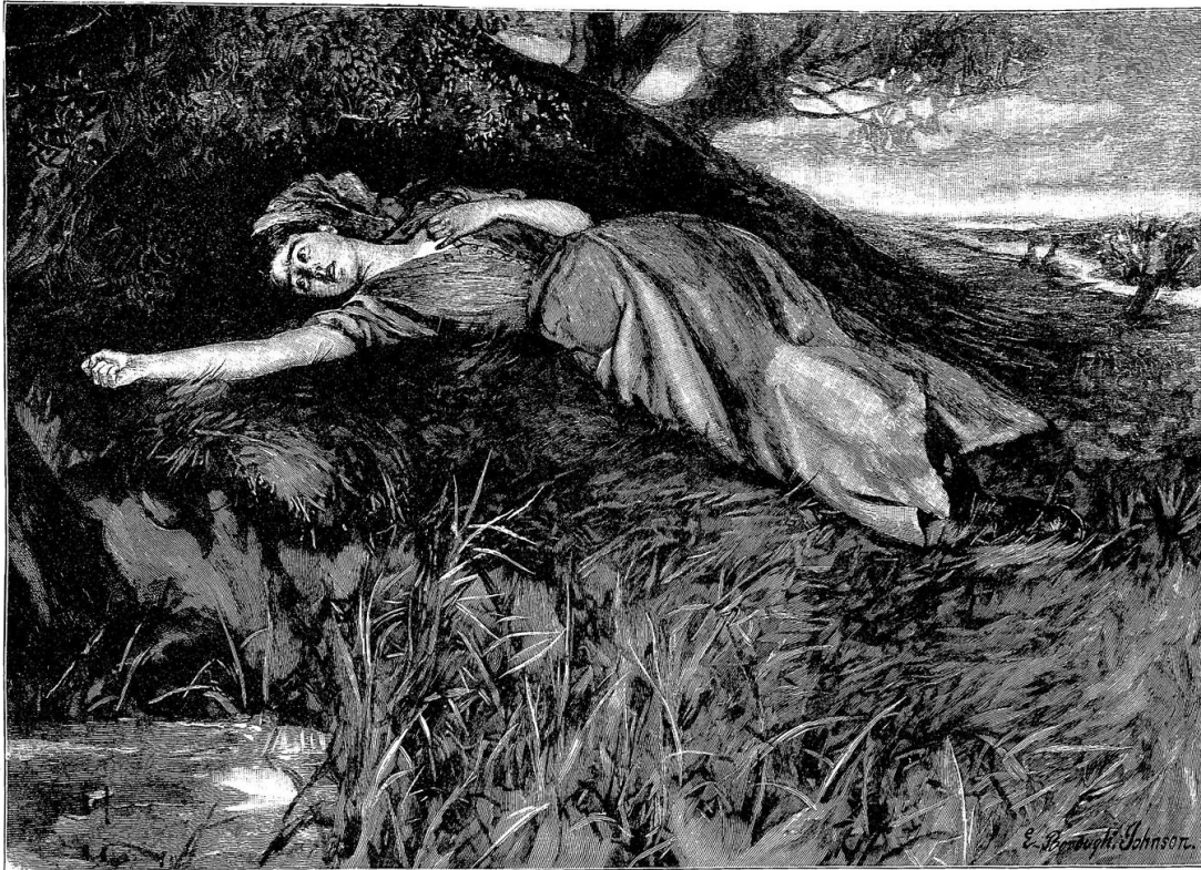
"Tess flung herself down upon the undergrowth of rustling spear-grass as upon a bed"

between confessing her relationship with Alec and accepting Angel's marriage proposal.