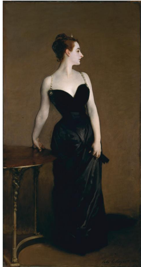
Figure 11 Singer Sargent, John. Madame X . 1883-1884, The Metropolitan Museum of Art, "The Metropolitan Museum of Art , The Metropolitan Museum of Art, www.metmuseum.org/art/collection/search/20012492 . Accessed 13 Jan. 2019.