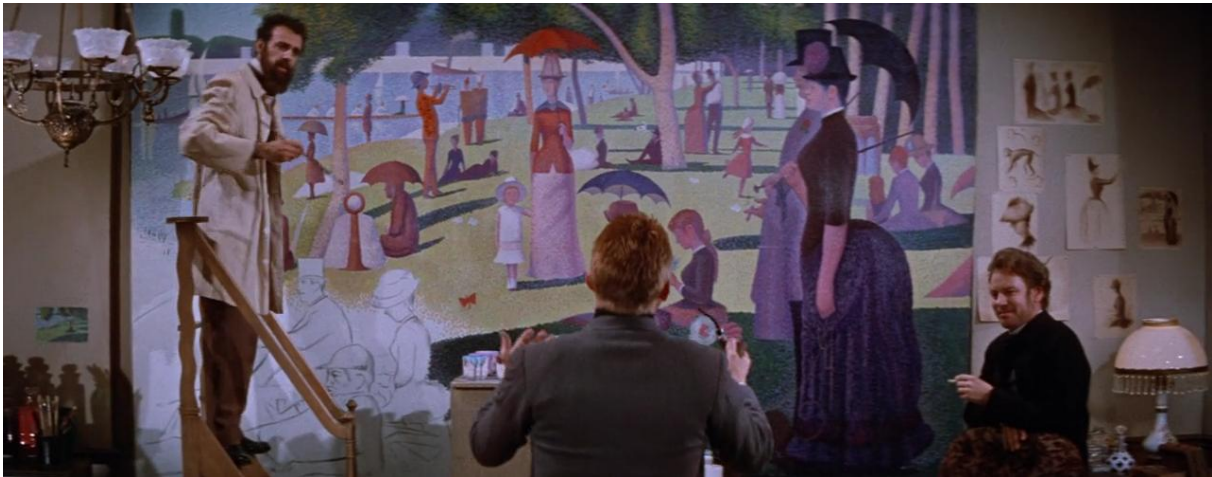
Figure 6 Still from Minelli, Lust for Life (51:14)