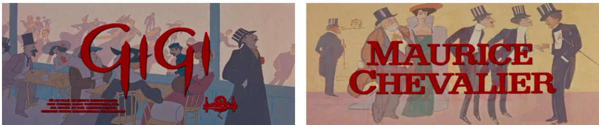
Figure 8 Stills from Minnelli, Gigi (00:26, 0:36)

Opening credits sometimes have a more important role in the film as a whole than a regular filmgoer might suspect. And while an average modern-day consumer of classical Hollywood cinema would normally not give that much attention to a list of names that appear before their eyes in the early minutes of a film, anxiously awaiting for the real action to start, doing so with those featured in Gigi would certainly be a shame. The reason for that does not lie in the fact they would extract pieces of information on what they might expect in the minutes that follow by reading the text, but mostly because they would achieve that goal by paying attention to what appears in the background. In this case, when deciphered appropriately, Gigi 's opening credits allow the spectator to comprehend the overall tone of the