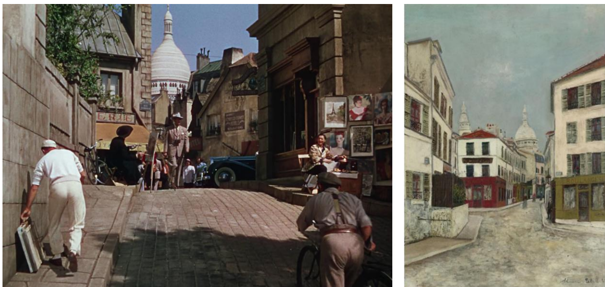
Figure 1 Still from Minnelli, An American in Paris (18:57); Utrillo, Maurice. La Rue Norvins a Montmartre . 1910. "MutualArt," MutualArt, MutualArt Services, Inc., 2009, www.mutualart.com/Artwork/LA-RUE-NORVINS-A-MONTMARTRE/812E29157F2D236E . Accessed 13. Jan. 2019.

Milo in return for his affections. In fact, for him accepting it would mean that he is not much of a painter since at the beginning of the film he states that "if you can't paint in Paris give up and marry the boss' daughter" ( An American in Paris ). Jerry eventually grabs Milo's offer and agrees to set up the exhibition in three months during which he produced a number of canvases that resembled both those hanging in his room at the beginning of the film, and the ones exposed in the Montmartre street. Most of those paintings were uninspiring cityscapes resembling Utrillo's works, with the addition of several still lifes and portraits, including the one depicting Lise. However, one of the sequences reveals Jerry in front of Théâtre National de l'Opéra transferring it on the canvas in various shades of yellow. Although we do not get the chance to see it again in the segment in which he starts to choose frames for the