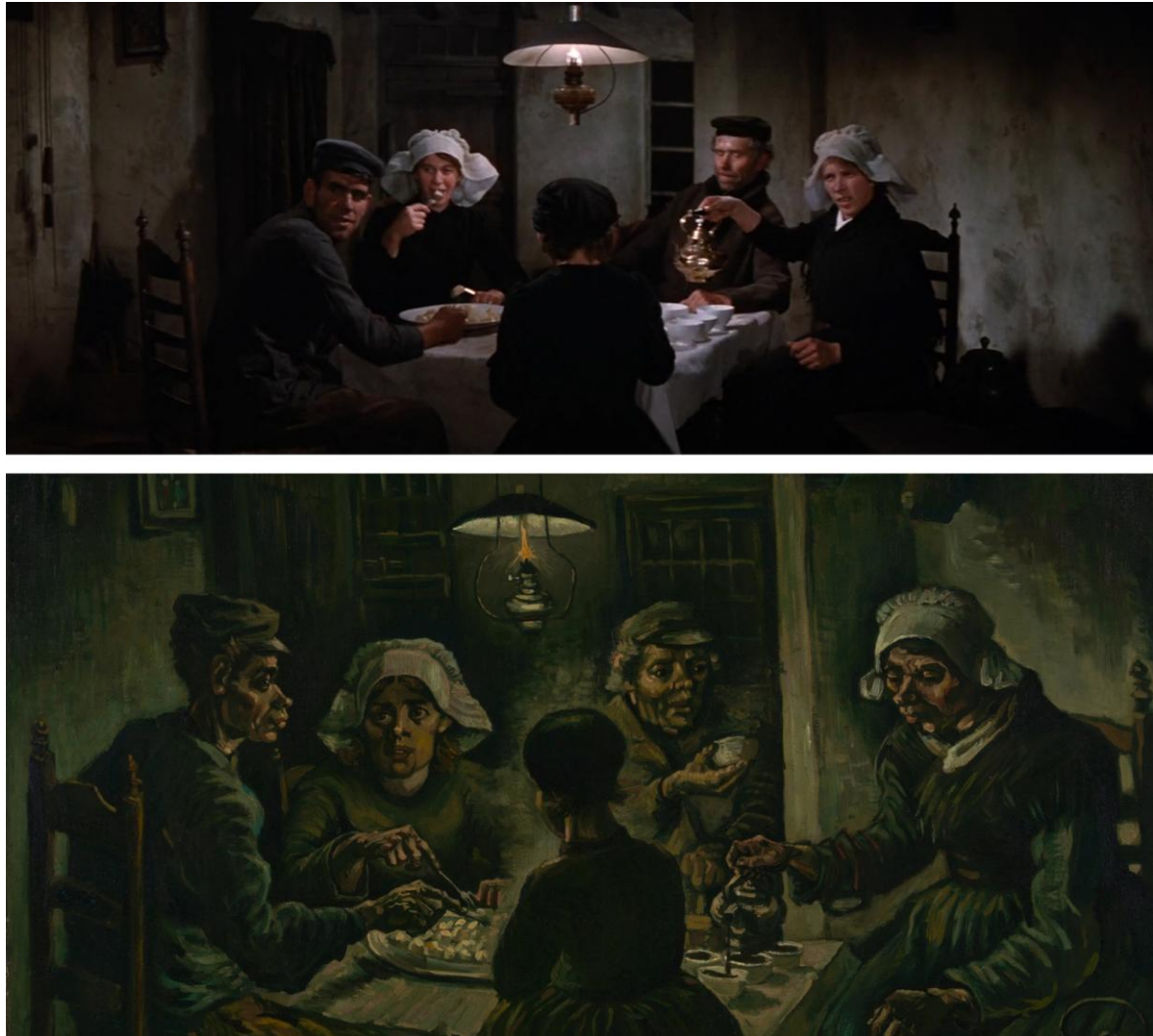
Figure 5 Still from Minnelli, Lust for Life (46:45); Van Gogh, Vincent. The Potato Eaters . 1885, Van Gogh Museum, Amsterdam. "Van Gogh Museum," Van Gogh Museum , Van Gogh Foundation, www.vangoghmuseum.nl/en/collection/s0005V1962 . Accessed 13 Jan. 2019.

Van Gogh calls it "the good, dark color of our Dutch earth" 10 ( Lust for Life ). Although Minnelli manages to provide us with uncanny depiction of scenes as the artist must have seen them, they still, despite the high level of naturalism, have more of a feeling of an overly arranged shop windows than something that would spark the compassion of an observer as Van Gogh's socially engaged canvases would (See Fig. 5).