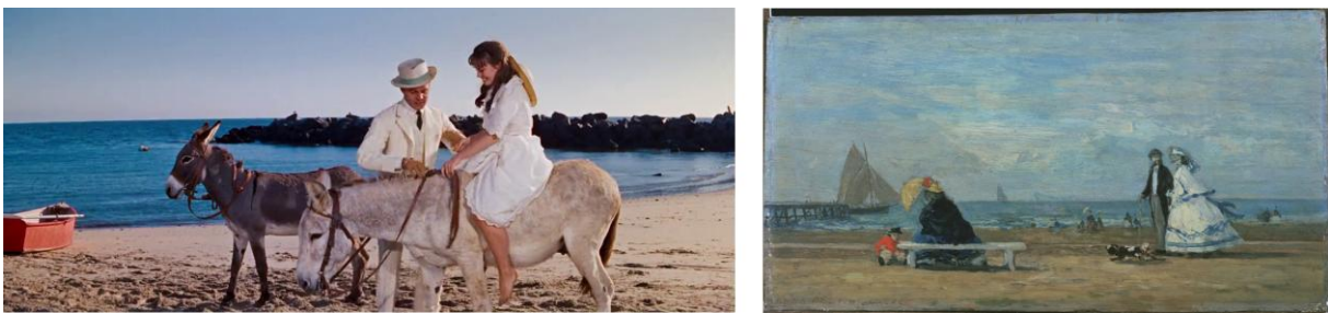
Figure 10 Still from Minnelli, Gigi (57:58); Boudin, Eugène. Beach at Trouville . 1863. "Google Arts & Culture," Google Arts & Culture , artsandculture.google.com/asset/beach-at-trouville/JQGDYtZbt3L0Xg . Accessed 13 Jan. 2019.

Johnson mentions both Renoir and Manet as possible references that can be found in the scenes set in Trouville (39-41), while Harvey points out to Boudin as the one who inspired the same scenes (147). However, neither of the two mentions which works of those prominent artists might have served as a source material. In Eugène-Louis Boudin's oeuvre several canvases (e.g. Beach at Trouville , 1863) depicting the landscapes of Trouville can be found,