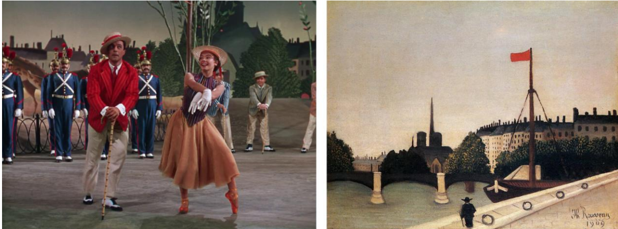
Figure 3 Still from Minnelli, An American in Paris (1:44:42); Rousseau, Henri. Notre Dame: View of the Ile Saint-Louis from the Quai Henri IV . 1909, The Philips Collection, Washington. "The Philips Collection," The Philips Collection , The Philips Collection, www.phillipscollection.org/collection/browse-the-collection?id=1694 . Accessed 13 Jan. 2019.

Dominant elements of this set design include characteristic Rousseau greenery with specific formation of leaves that dominate on a number of his paintings, including The Hungry Lion Throws Itself on the Antelope from 1905 or The Garden Dream from 1910. Ronald Alley states that Rousseau's "motifs were drawn from the unfashionable suburbs of the city, its