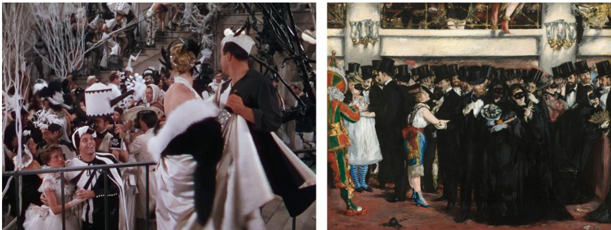
Figure 2 Still from Minnelli, An American in Paris (1:28:50); Manet, Edouard. Masked Ball at the Opera . 1873., National Gallery of Art, Washington. "National Gallery of Art," National Gallery of Art , www.nga.gov/collection/art-object-page.61246.html . Accessed 13 Jan. 2019.

The final scene prior to Jerry's dream sequence takes place at the New Year's Eve Art Students Ball. In terms of color, the entire set and costume design were based on nothing more than black and white, which can also be seen as a kind of a coloristic pause before the upcoming outburst of color. Although they are evidently set in two different time periods, and