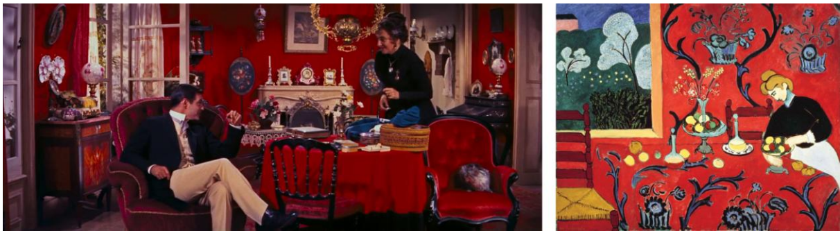
Figure 9 Still from Minnelli, Gigi (15:19); Matisse, Henri. The Dessert: Harmony in Red . 1908. "Henri Matisse," Henri Matisse , www.henrimatisse.org/the-dessert-harmony-in-red.jsp# . Accessed 13 Jan. 2019.

One of the most prominent set designs where various events during the entire film take place irresistibly evokes yet another art reference – the residence of Gigi’s family, i.e. of her grandmother and mother whom we only get the opportunity to hear singing, which can also be seen as a running gag of a kind throughout the film. What brings this apartment of a rather