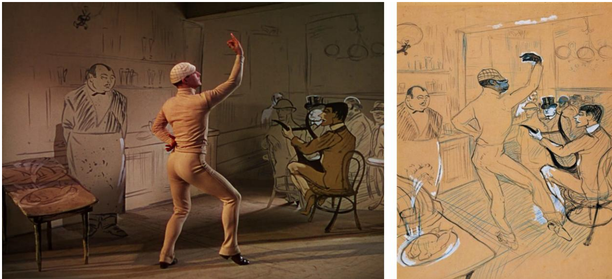
Figure 4 Still from Minnelli, An American in Paris (1:49:06); Toulouse-Lautrec, Henri de. Chocolat dansant . 1896. "Musée Occitanie," Musée Occitanie, Association des Conservateurs et Personnels Scientifiques de Musée Occitanie, musees-occitanie.fr/musees/musee-toulouse-lautrec/collections/la-collection-toulouse-lautrec/henri-de-toulouse-lautrec/chocolat-dansant/ . Accessed 13 Jan. 2019.

the Van Gogh section” (“S Wonderful). Yellow, as well as some shades of orange that increase the warmth of the atmosphere, is not the only thing that derives from famous painter’s canvases. The entire architecture seems like it was built out of energetic and short brushstrokes that are the characteristic of Van Gogh’s technique. In addition, further in the background another famous element from his painting can be noticed – swirly stars from his The Starry Night from 1889, which in this case covered the entire sky in the rhythmic exchange of yellow and orange strokes, instead of appearing against the cobalt blue of the sky.