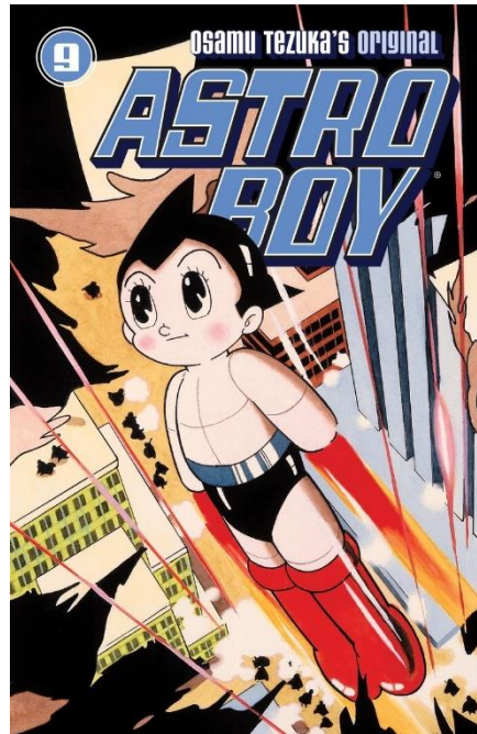
Tezuka, Osamu. "Astro Boy (Book 9)." Dark Horse Manga, 2002

The end of the 20 th century is recognised as "the golden era of anime". The 1980s marked the time when Japanese animation gained enormous popularity producing anime of robot, cyberpunk and space opera genres. The "Dragon Ball Z" series and the post-apocalyptic film "Akira" that emerged from this period are some of the best examples of Japanese animation. During these years, Hayao Miyazaki founded Studio Ghibli along with Isao Takahata and introduced the world to some of anime classics, such as "Nausicaä of the Valley of the Wind" and "Grave of the Fireflies".