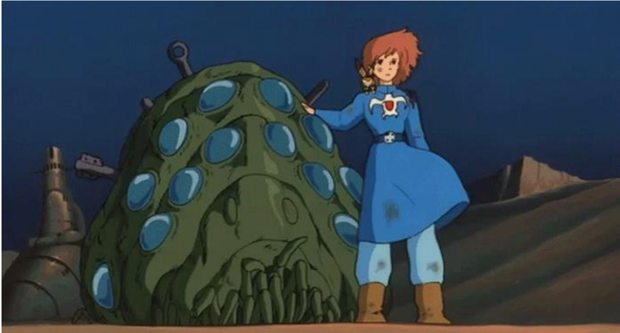
Miyazaki, Hayao. "Nausicaä of the Valley of the Wind" Toei Animation, 1984

All of these symbols contribute to the morality of the story – to live in peace and harmony with the nature. In return, humanity gets a chance to start over, undo their mistakes and cherish the extraordinary world they live in.