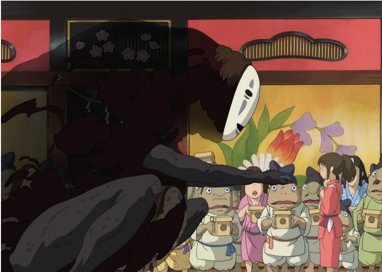
Miyazaki, Hayao. "Spirited Away" Studio Ghibli, 2001