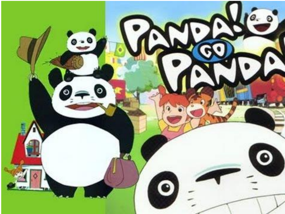
Takahata, Isao. "Panda! Go Panda!" A Productions, 1972

in the production of another theatrical film, "Panda! Go Panda!", whose success would lead to a sequel called "Panda! Go Panda! Rainy-Day Circus".