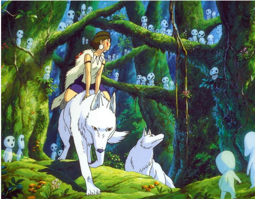
Miyazaki, Hayao. "Princess Mononoke" Studio Ghibli, 1997