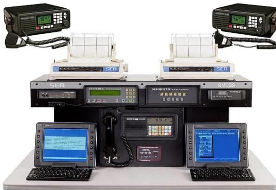
Picture 8. GMDSS

However, if disaster overwhelms a vessel before an alert can be initiated, a float-free satellite EPIRB is automatically released and activated. This alert is received and decoded by the polar orbiting COSPAS-SARSA T satellites with a subsequent link into the GMDSS radionet.“ [6]