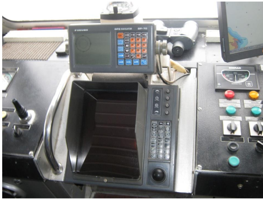
Picture 10. GPS - Catamaran Olea